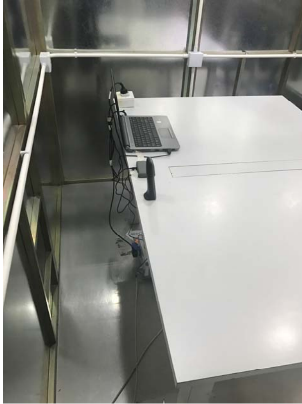
Side View 2