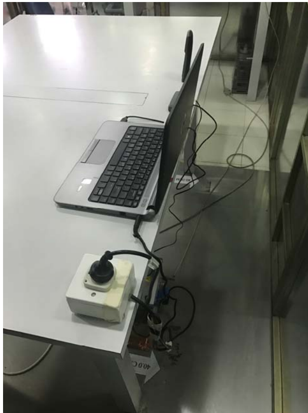
Side View 1

Test Report Number: 17071648HKG-001 FCC ID: MZV2-142A IC: 3912A-2142A