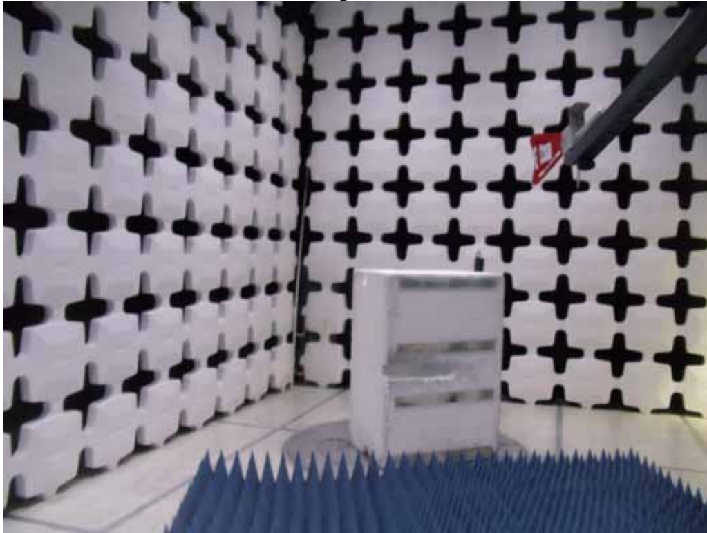
Test Setup for Radiated Emissions, 1GHz to 18GHz – Horizontal Polarization