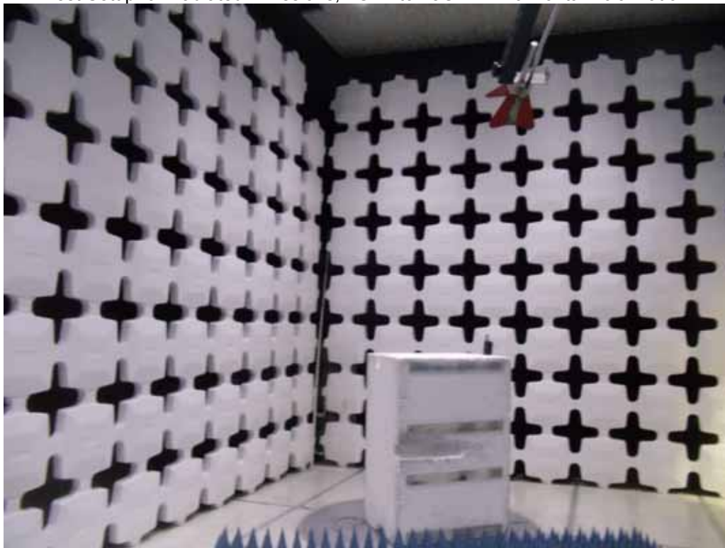
Test Setup for Radiated Emissions, 1GHz to 18GHz – Vertical Polarization