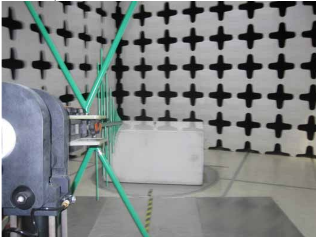
Test Setup for Radiated Emissions, 30MHz to 1GHz – Vertical Polarization