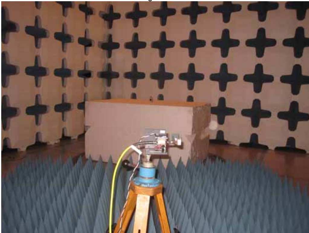
Test Setup for Radiated Emissions, 18GHz to 25GHz – Horizontal Polarization