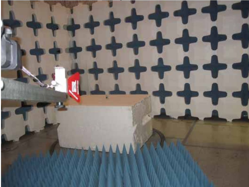
Test Setup for Radiated Emissions, 1GHz to 18GHz – Horizontal Polarization