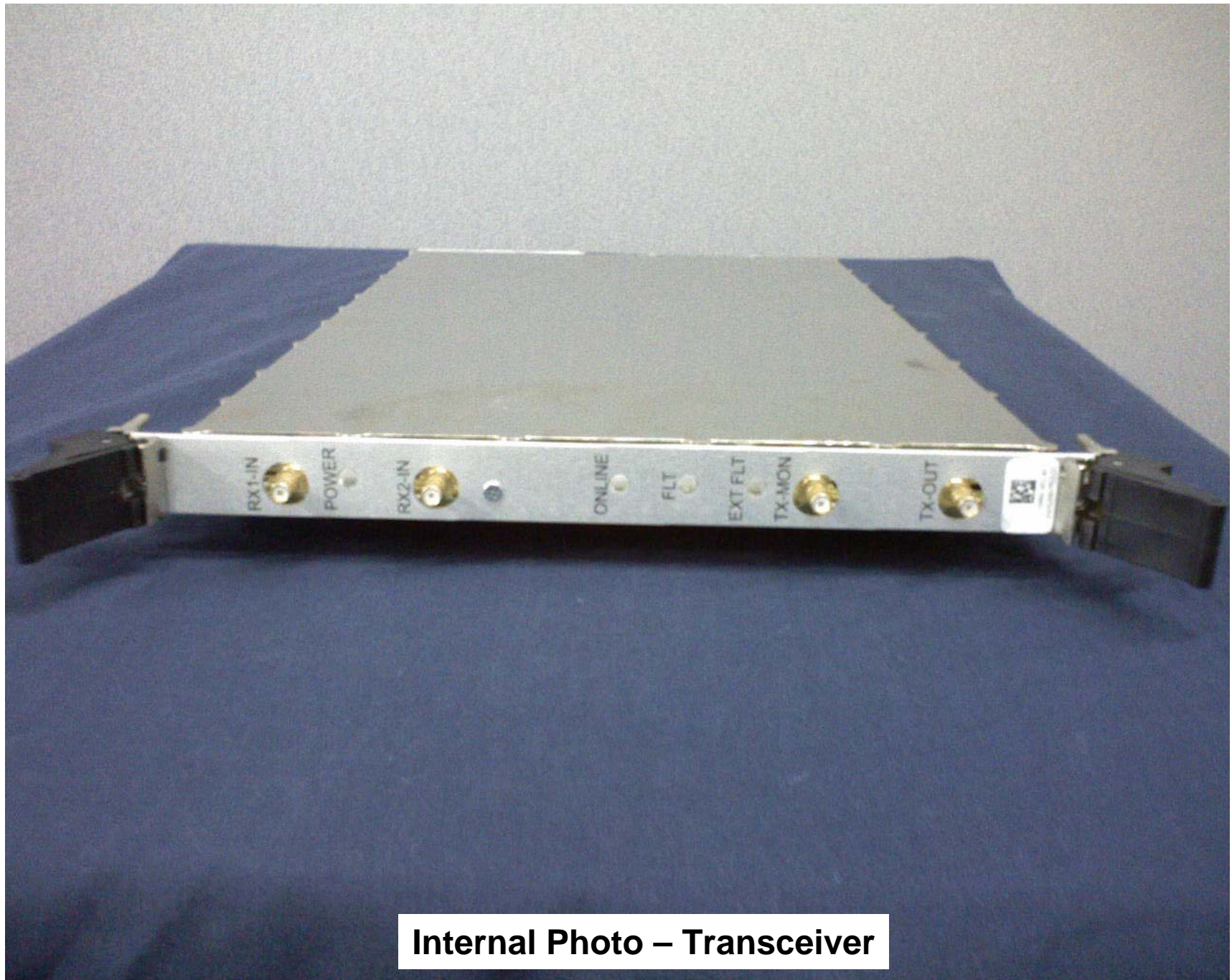
Internal Photo – Transceiver