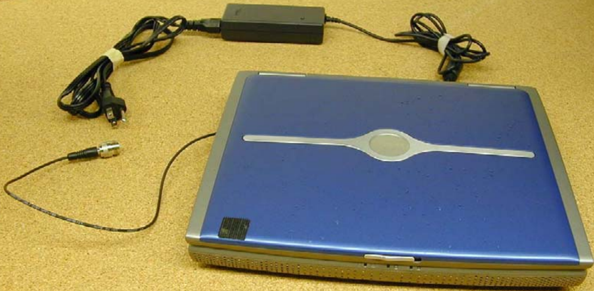
PCMCIA Radio with Laptop