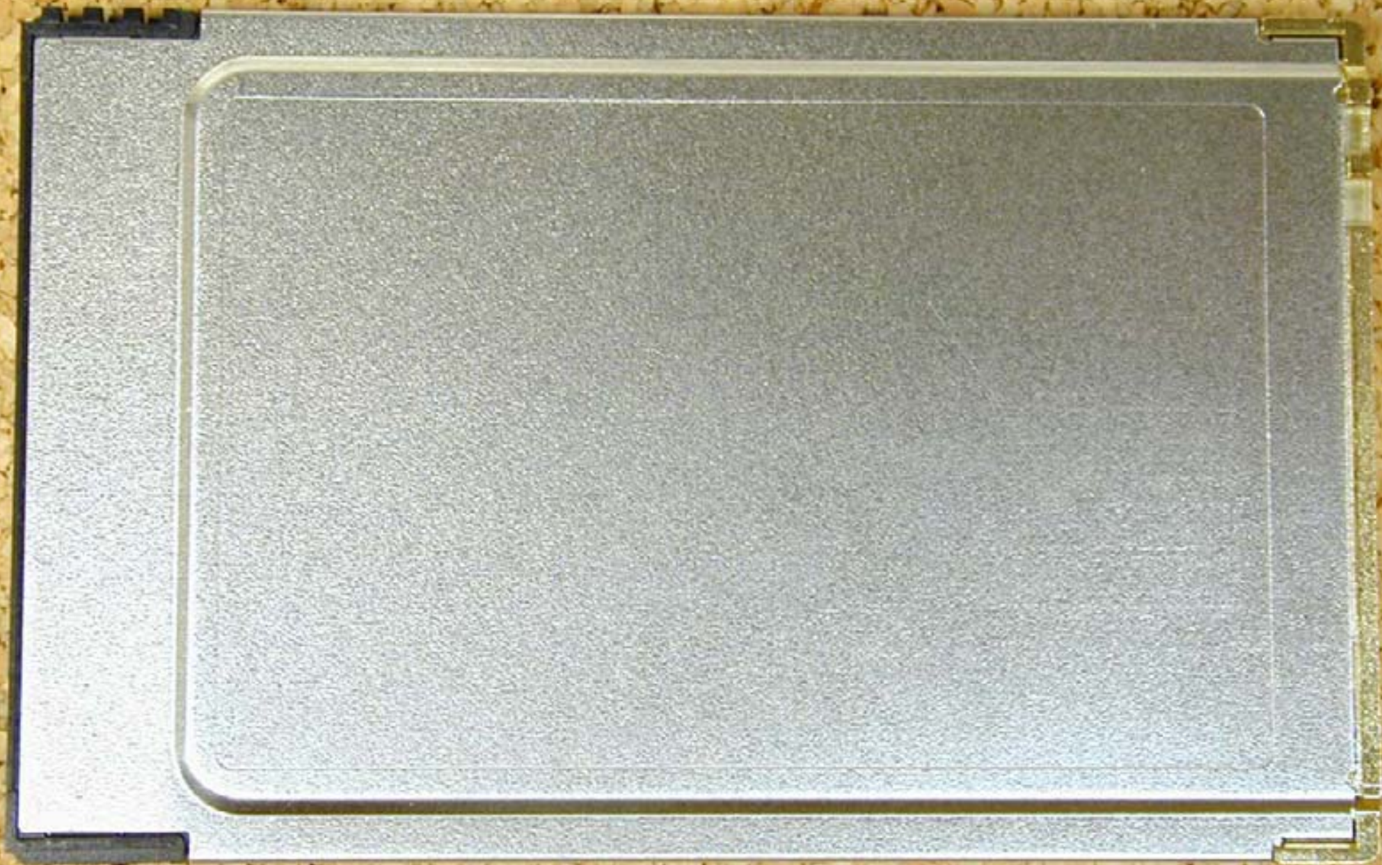
PCMCIA Radio (top)