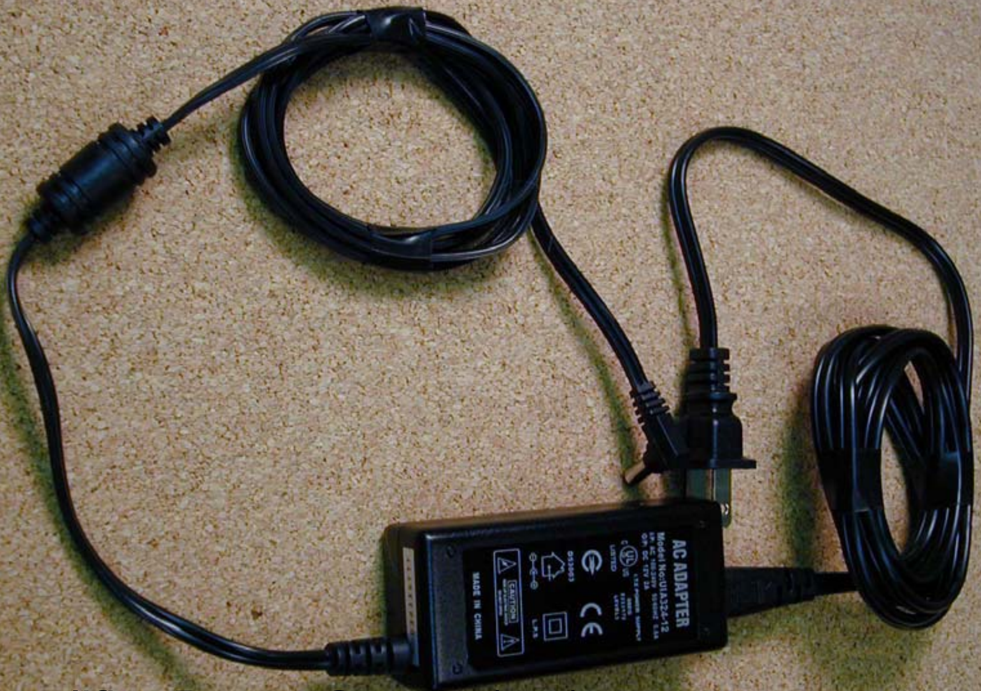
Amplifier Power Supply (top)