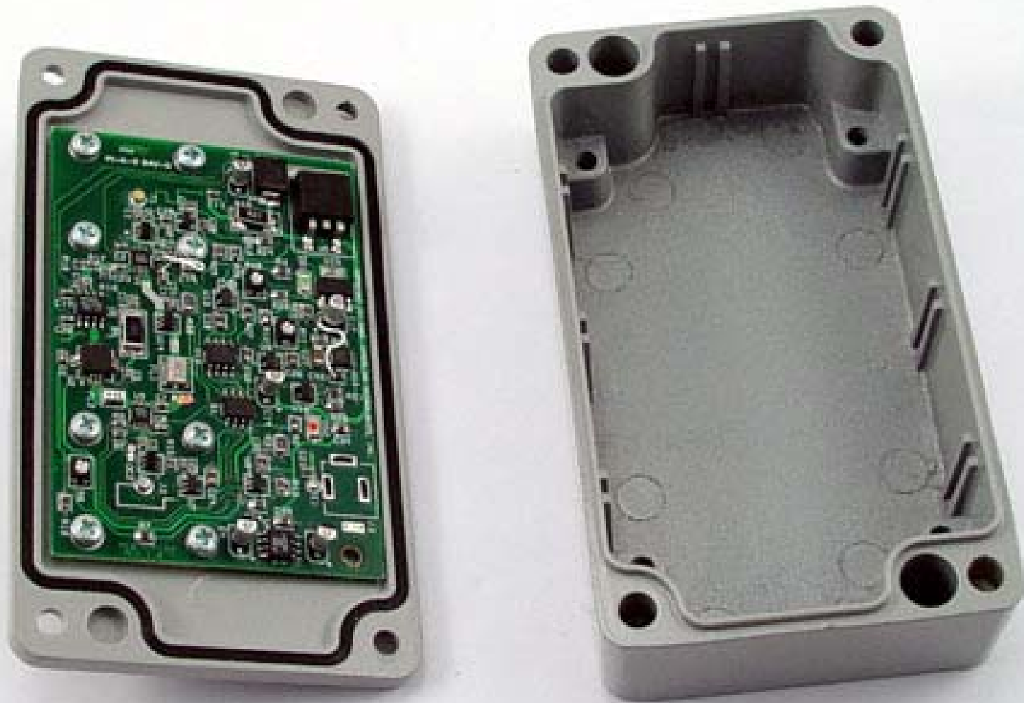
Amplifier (case apart)