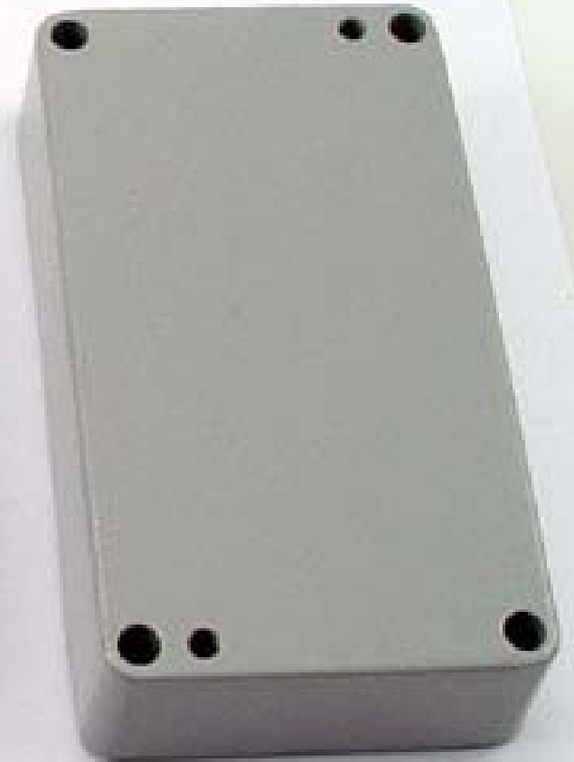
DUT apart (bottom)