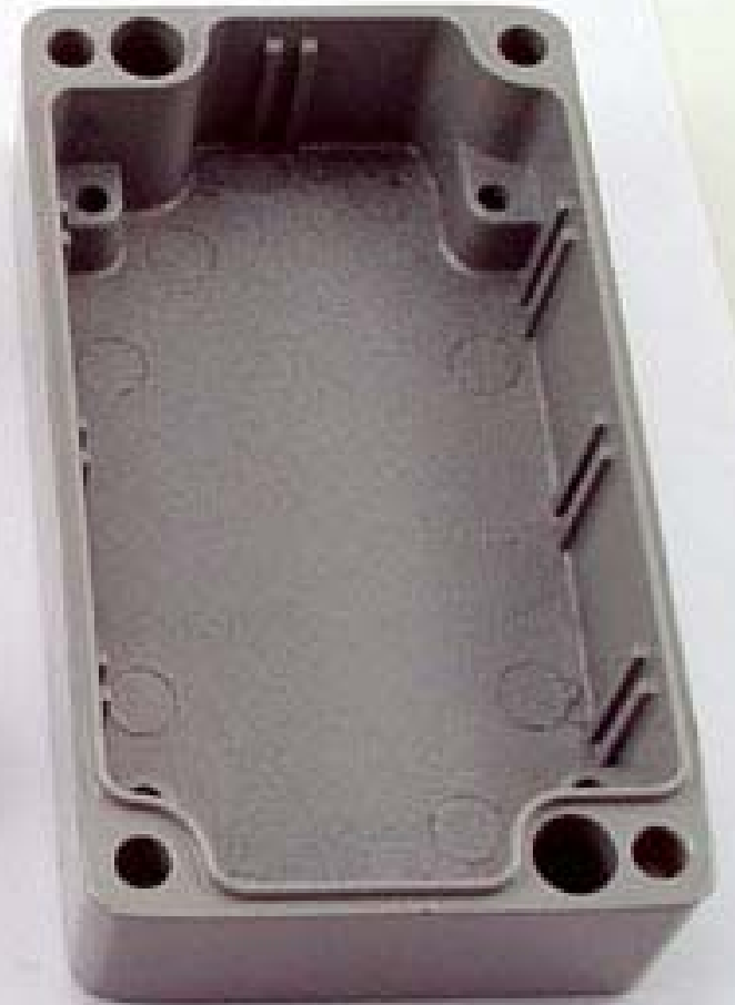
DUT apart (top)