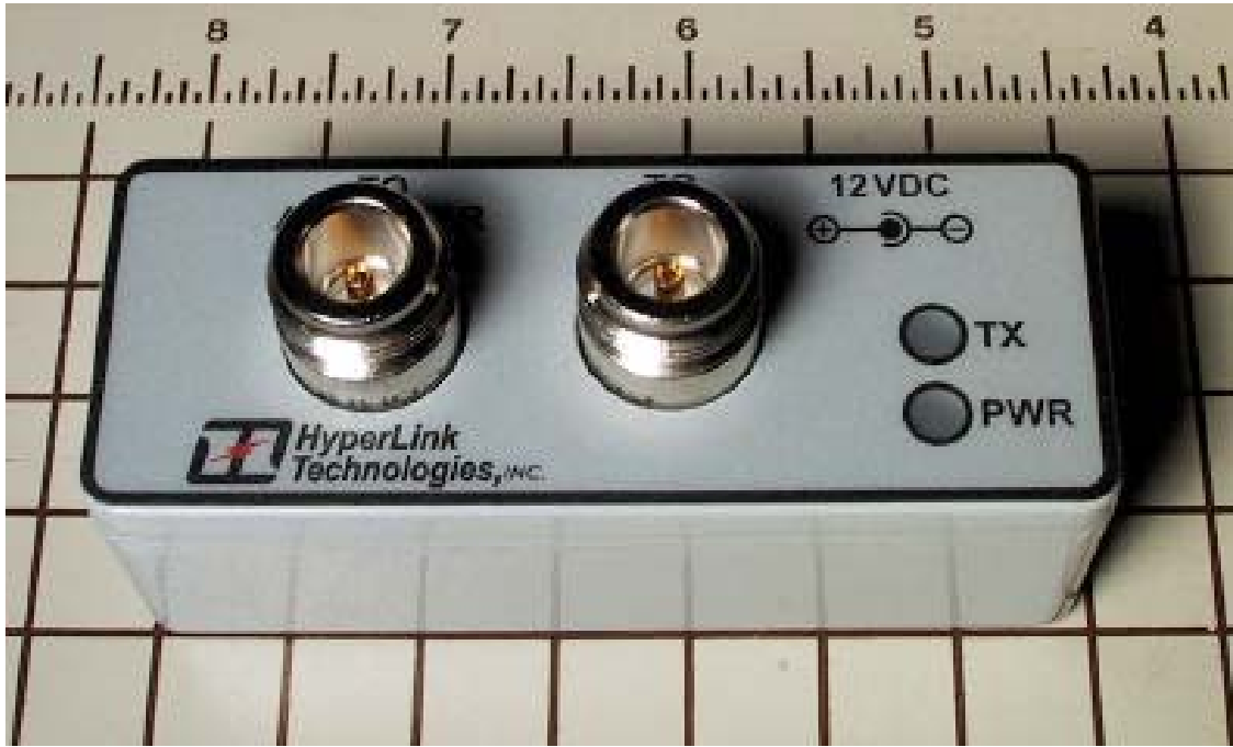
HyperLink Power Injector (Top)