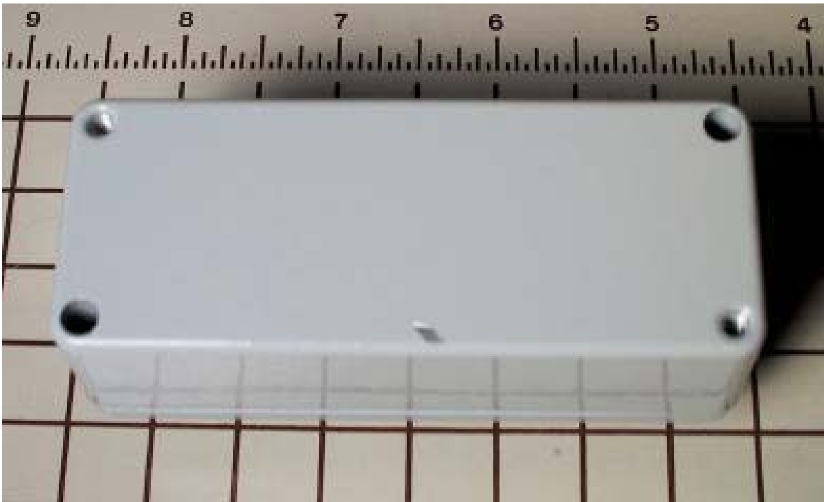
HyperLink Power Injector (Bottom)