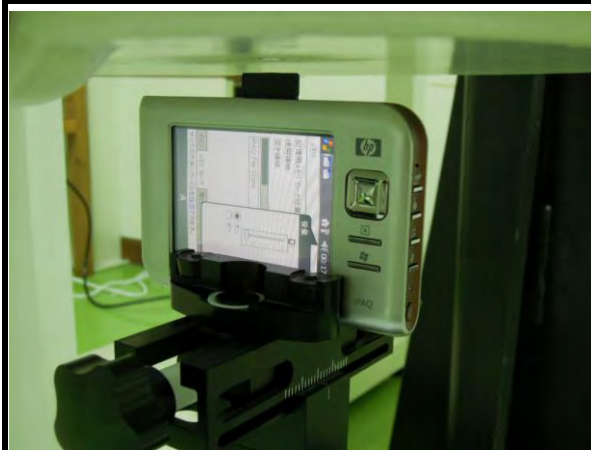
DUT Tip Side with Phantom 0.5 cm Gap (DUT + Host PDA)