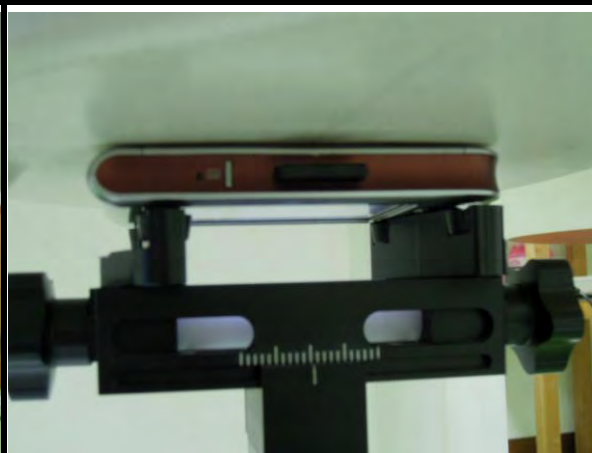
DUT Rear Face with Phantom 0.5 cm Gap (DUT + Host PDA)