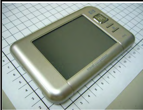
Host PDA for testing (Front View)