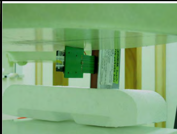
DUT Left Side with Phantom 0.5 cm Gap (DUT + SD Extending Card)