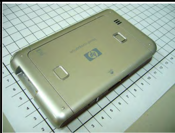
Host PDA for testing (Rear View)