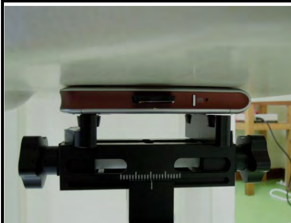
DUT Front Face with Phantom 0.5 cm Gap (DUT + Host PDA)