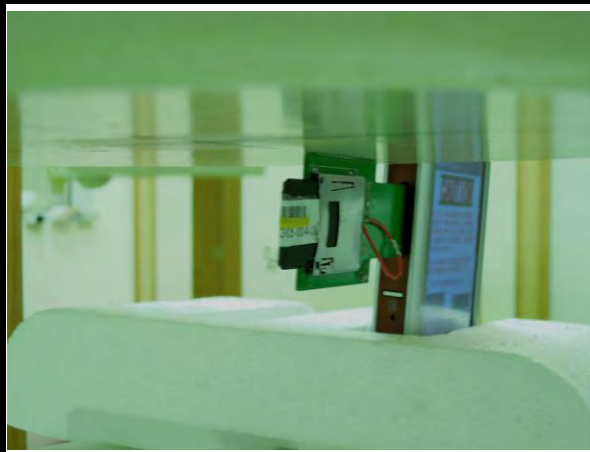
DUT Right Side with Phantom 0.5 cm Gap (DUT + SD Extending Card)