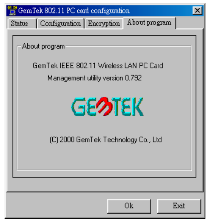
Figure 6 Management window with "ABOUT" tab open

About tab shows a software version. Users must use this version number when reporting their problems to tech support.