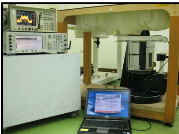
Test Setup Photo