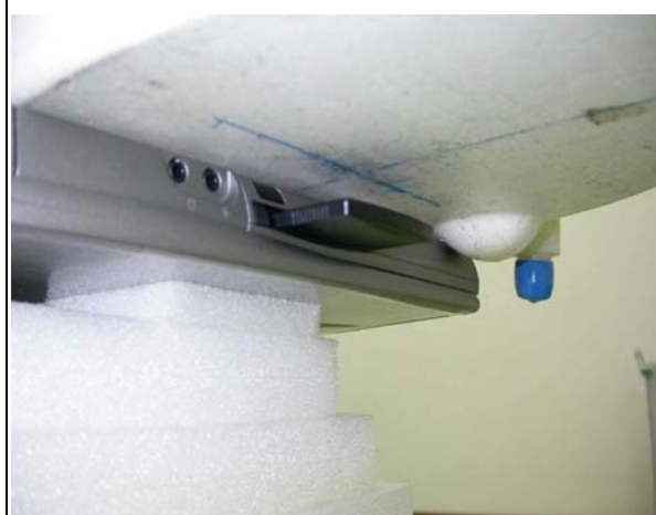
C: NOTEBOOK MODEL: D600

The bottom of the EUT face to the phantom with 15mm-separation distance.