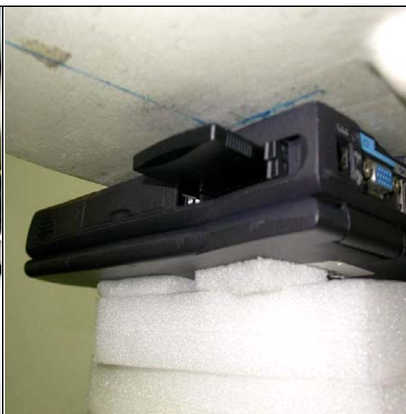
B: NOTEBOOK MODEL: C600

The bottom of the EUT face to the phantom with 10mm-separation distance.