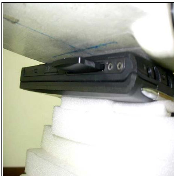
A: NOTEBOOK MODEL: N800C

The following test configurations have been applied in this test report: