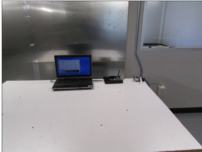
Figure 1: Powerline Conducted Front View