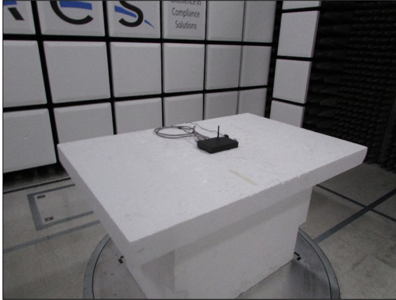
Figure 3: Radiated Emissions – Below 1GHz