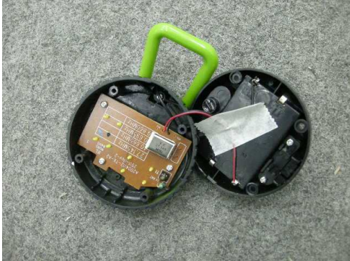
Rear View of the product (Internal)