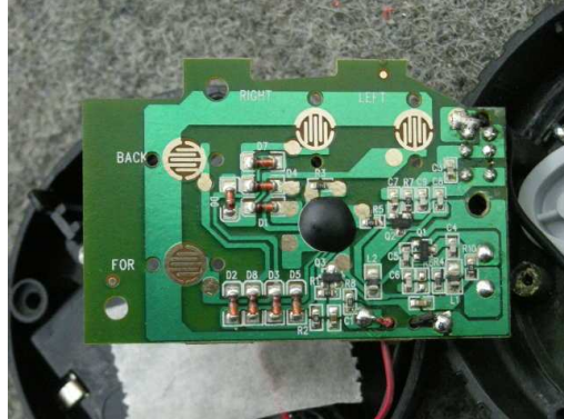
Inner Circuit Top View