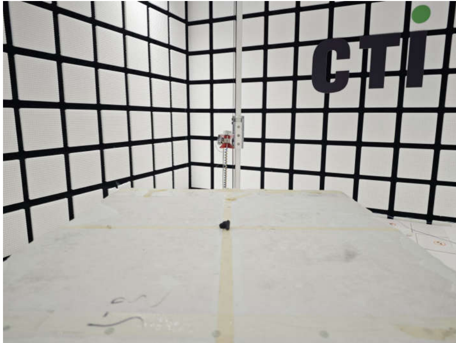
Radiated spurious emission Test Setup-2(Above 1GHz)(Ear L)