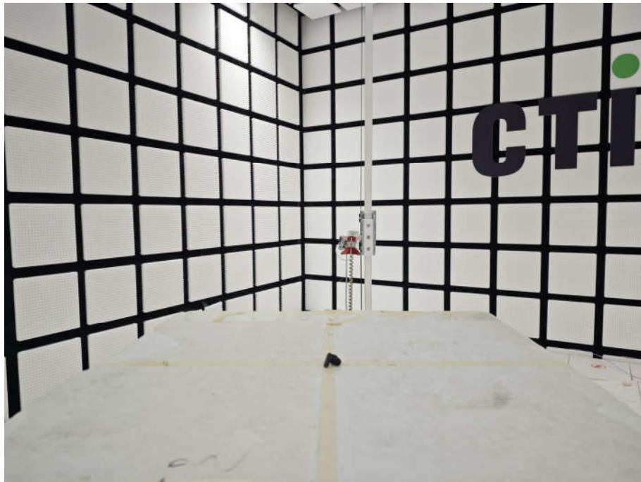
Radiated spurious emission Test Setup-2(Above 1GHz)(Ear R)