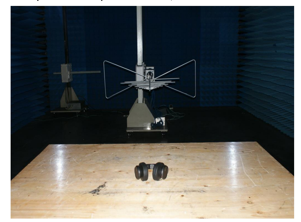
Photograph : Set-up for Radiated Spurious Emission,30MHz - 1GHz

Photograph : Set-up for Radiated Spurious Emission, 9KHz - 30MHz