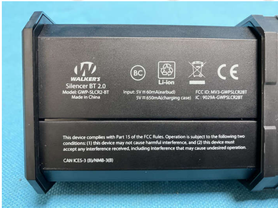
View of Product-10