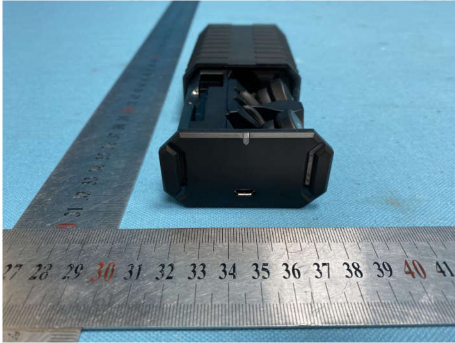
View of Product-7