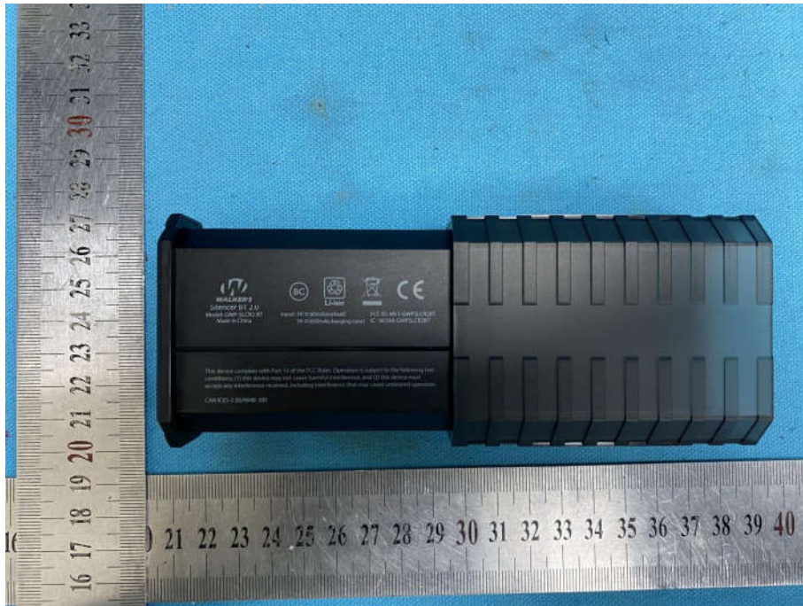
View of Product-3