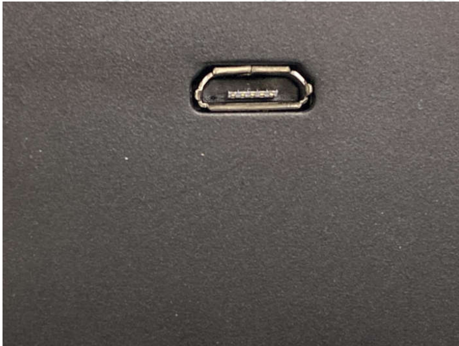
View of Product-8