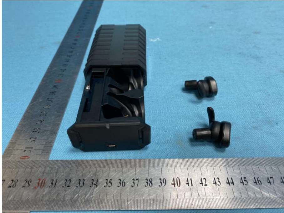
View of Product-9