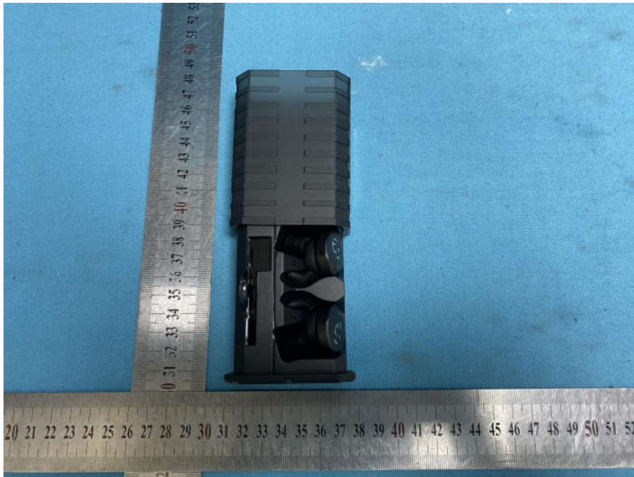
View of Product-2