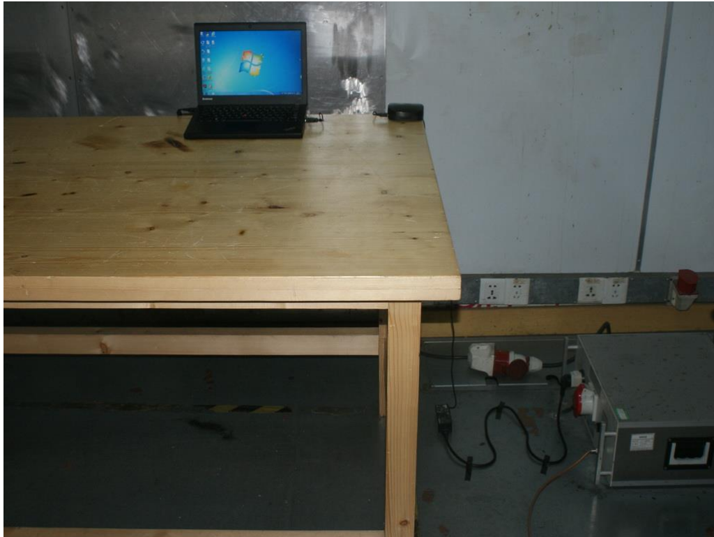
Photograph 1: Set-up for Conducted Emissions