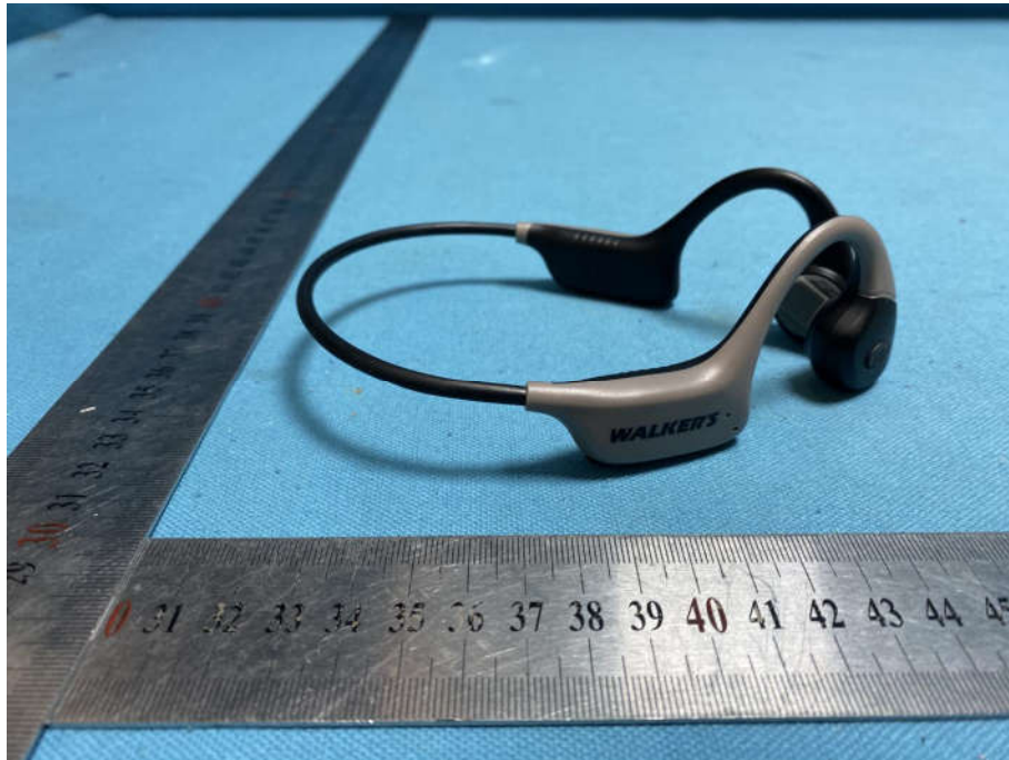
View of Product-7