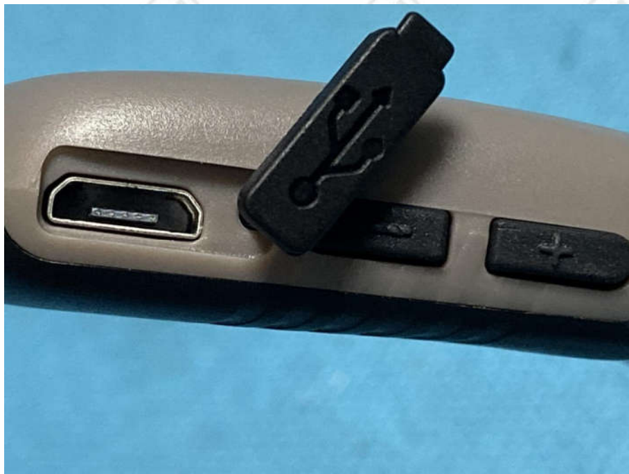
View of Product-8