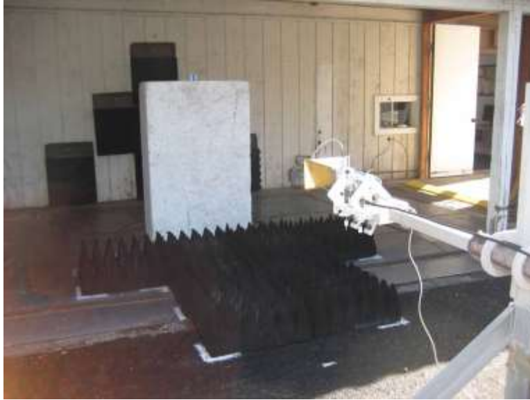
Above 1GHz Cone placement