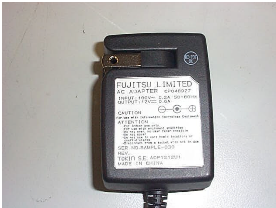
AC/DC Adapter (1)