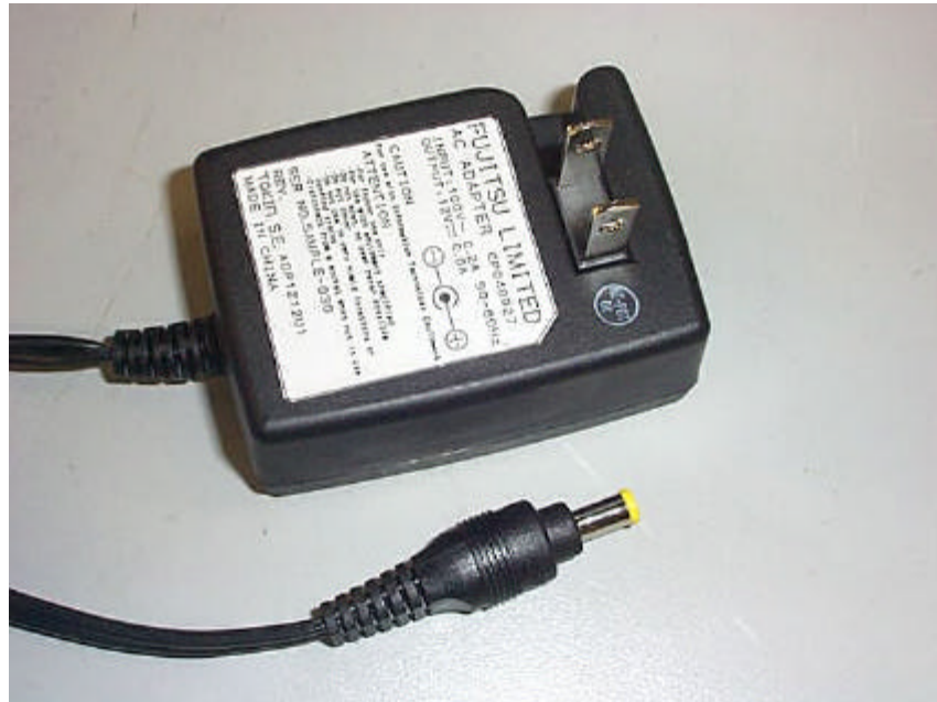
AC/DC Adapter (4)