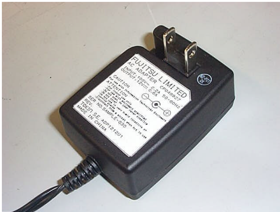
AC/DC Adapter (3)