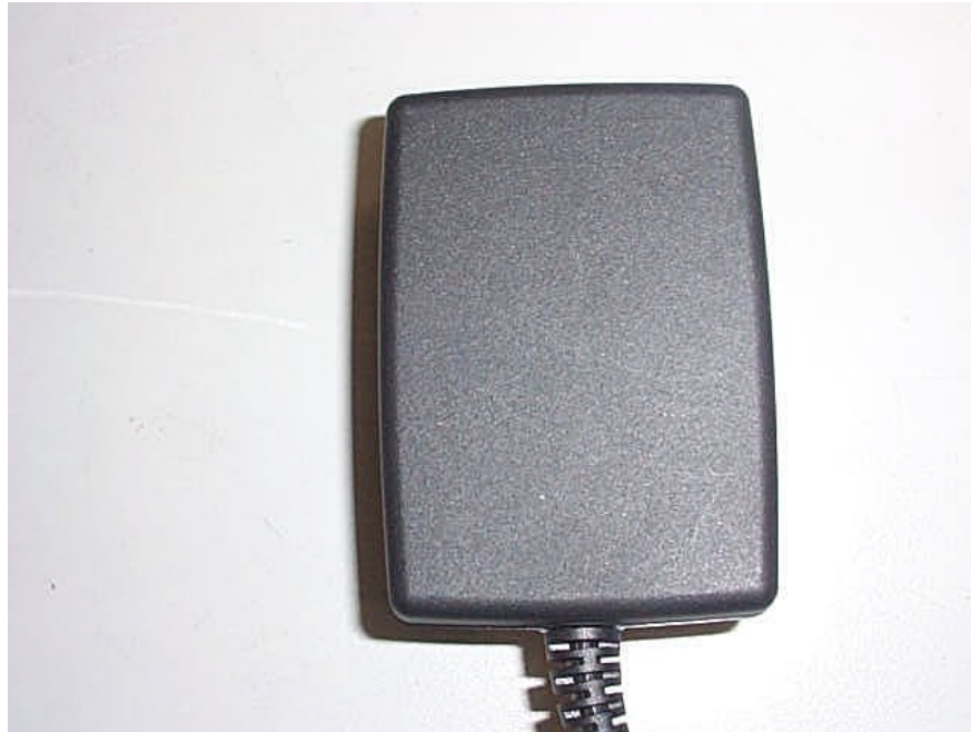
AC/DC Adapter (2)