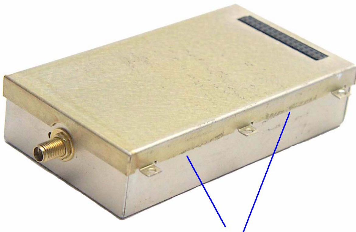
EMI gasket inserted between lid and the case of the module for compliance with receiver radiated emissions