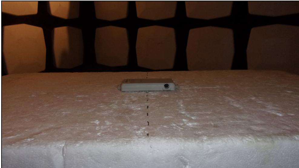
Figure 5: Radiated Emissions – ZPOS