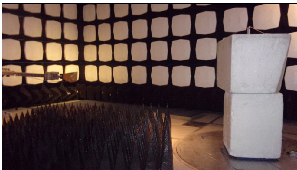
Figure 2: Radiated Emissions – 1GHz – 10GHz