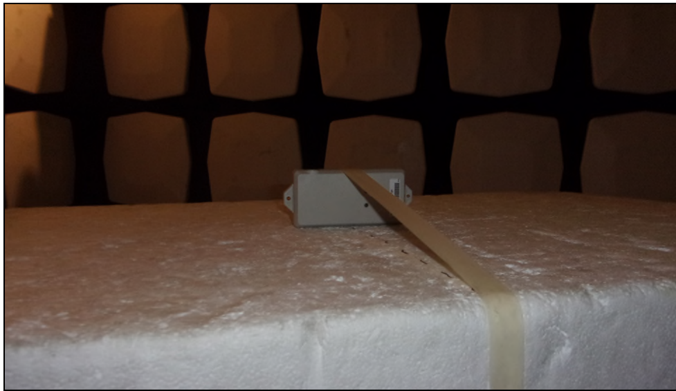
Figure 3: Radiated Emissions – XPOS