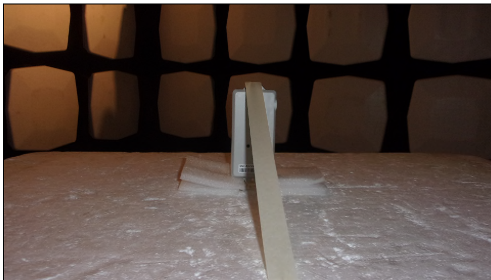
Figure 4: Radiated Emissions – YPOS