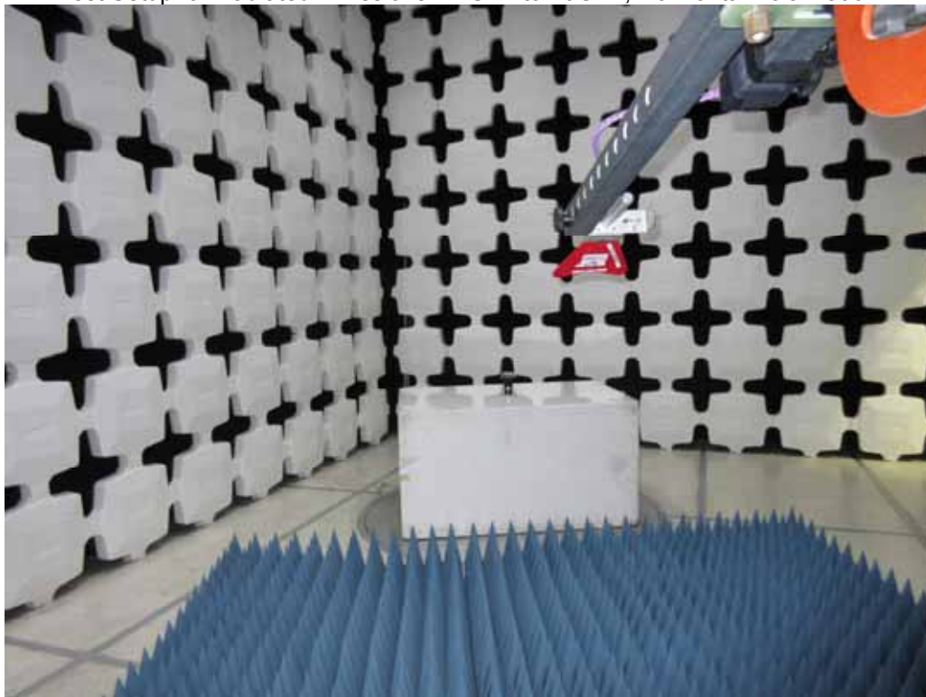
Test Setup for Radiated Emissions – 1GHz to 10GHz, Vertical Polarization