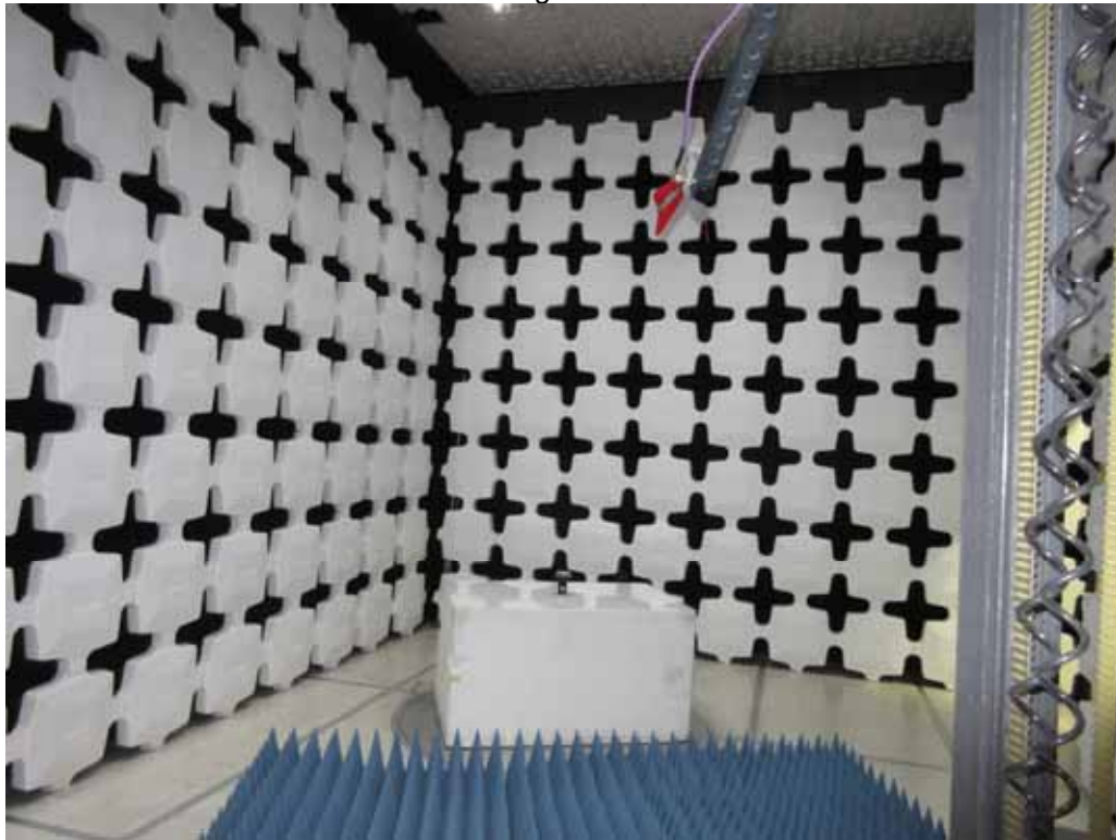
Test Setup for Radiated Emissions – 1GHz to 10GHz, Horizontal Polarization