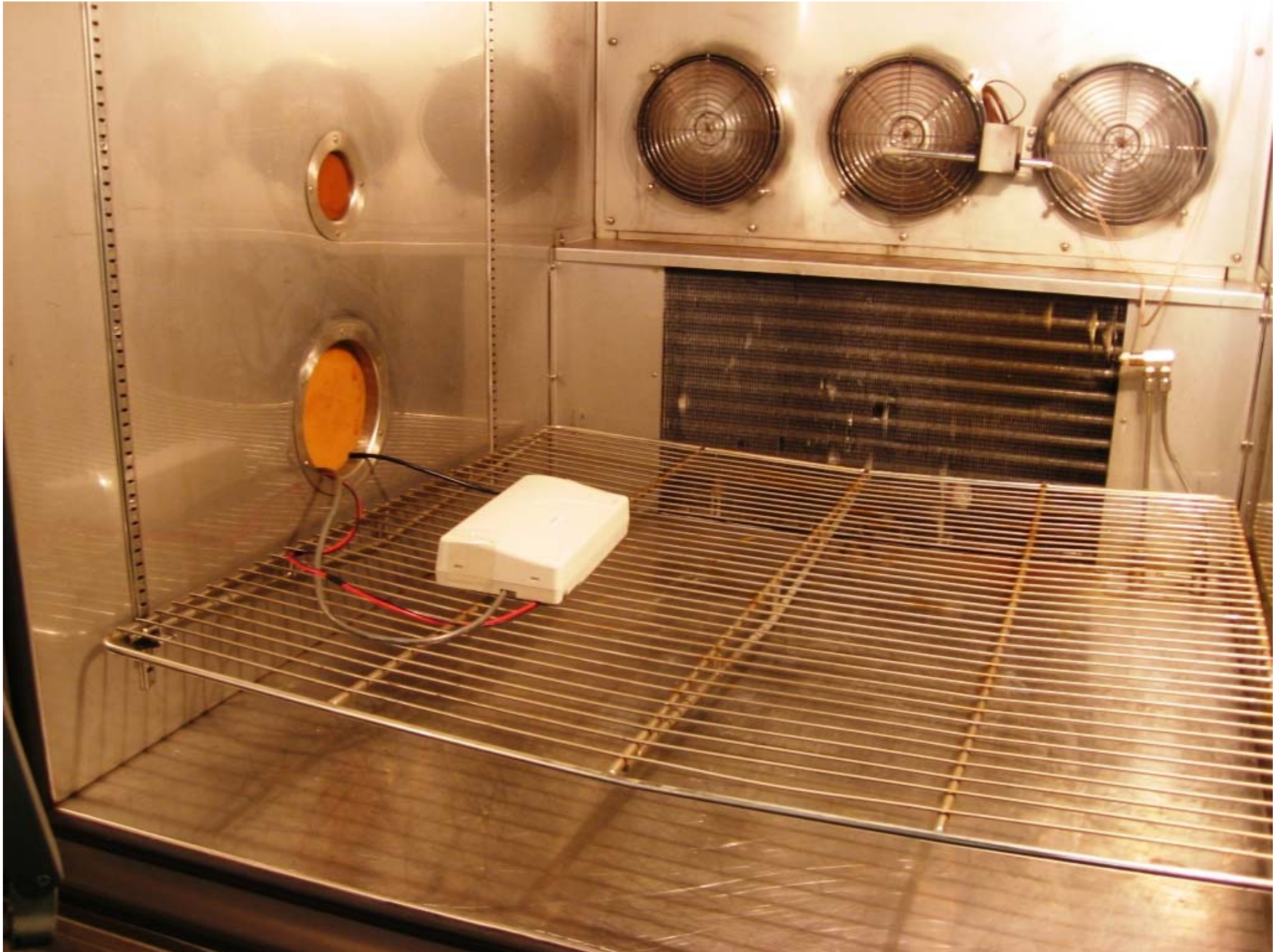
Figure 4: Frequency Stability Testing