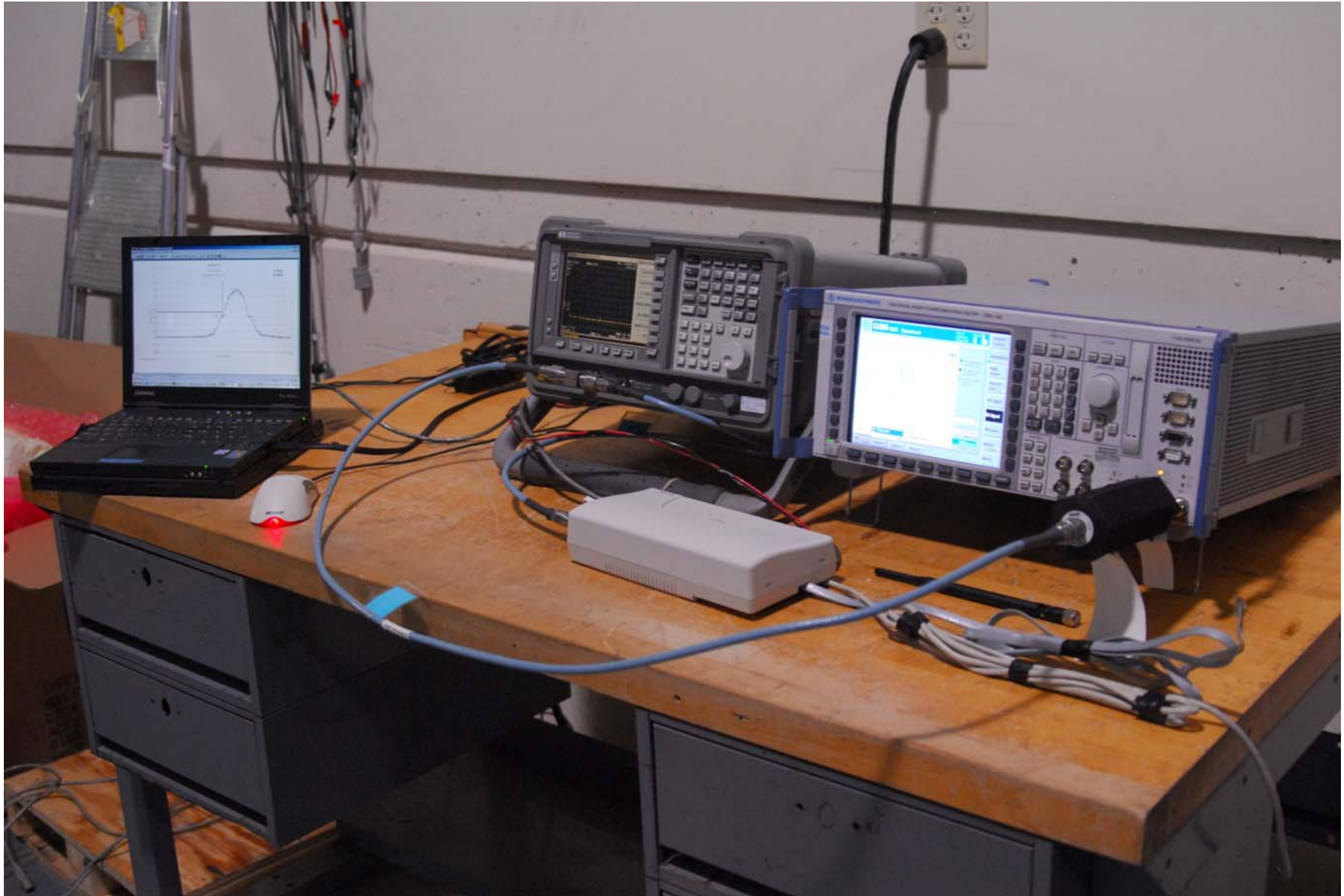
Figure 3: Antenna Terminal Conducted Testing