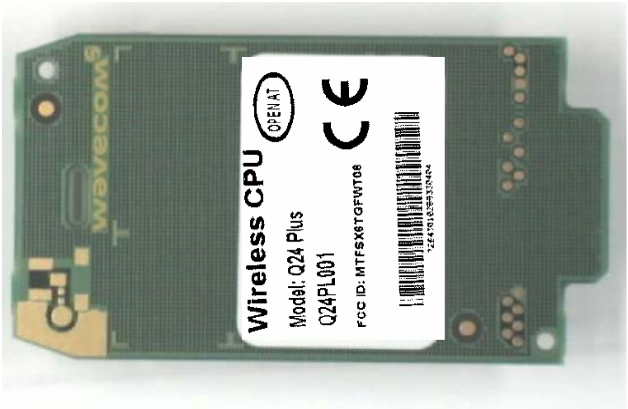
Figure 2: Label Location