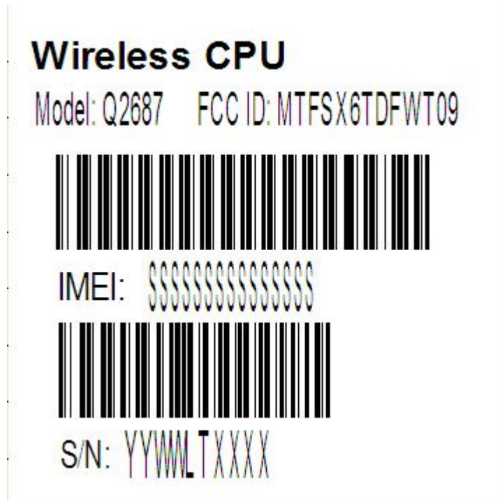
Figure 1: Sample Label

Note: Labeling information according to 15.19(a)(3) is located in the users manual due to the size if the EUT.