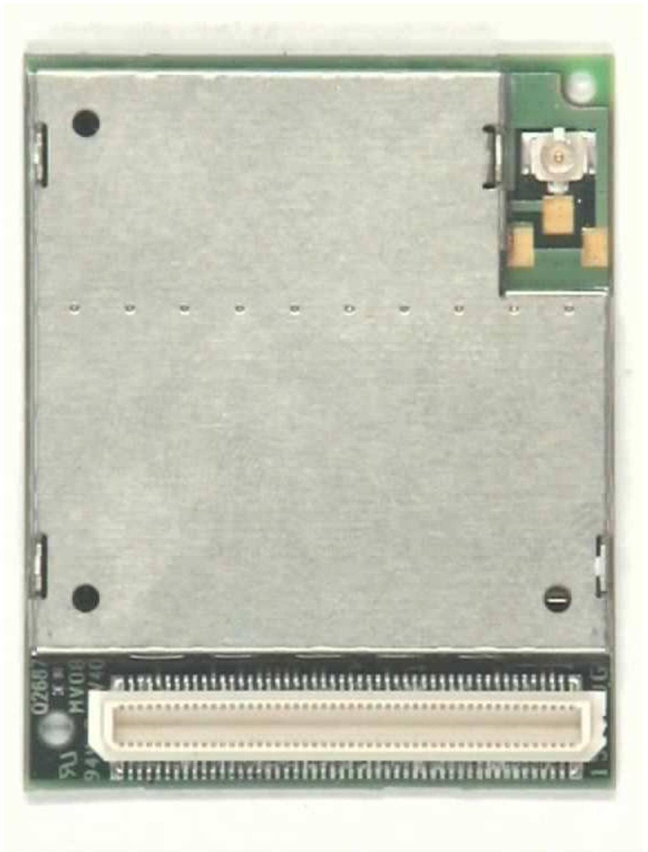
Figure 1: External - Front