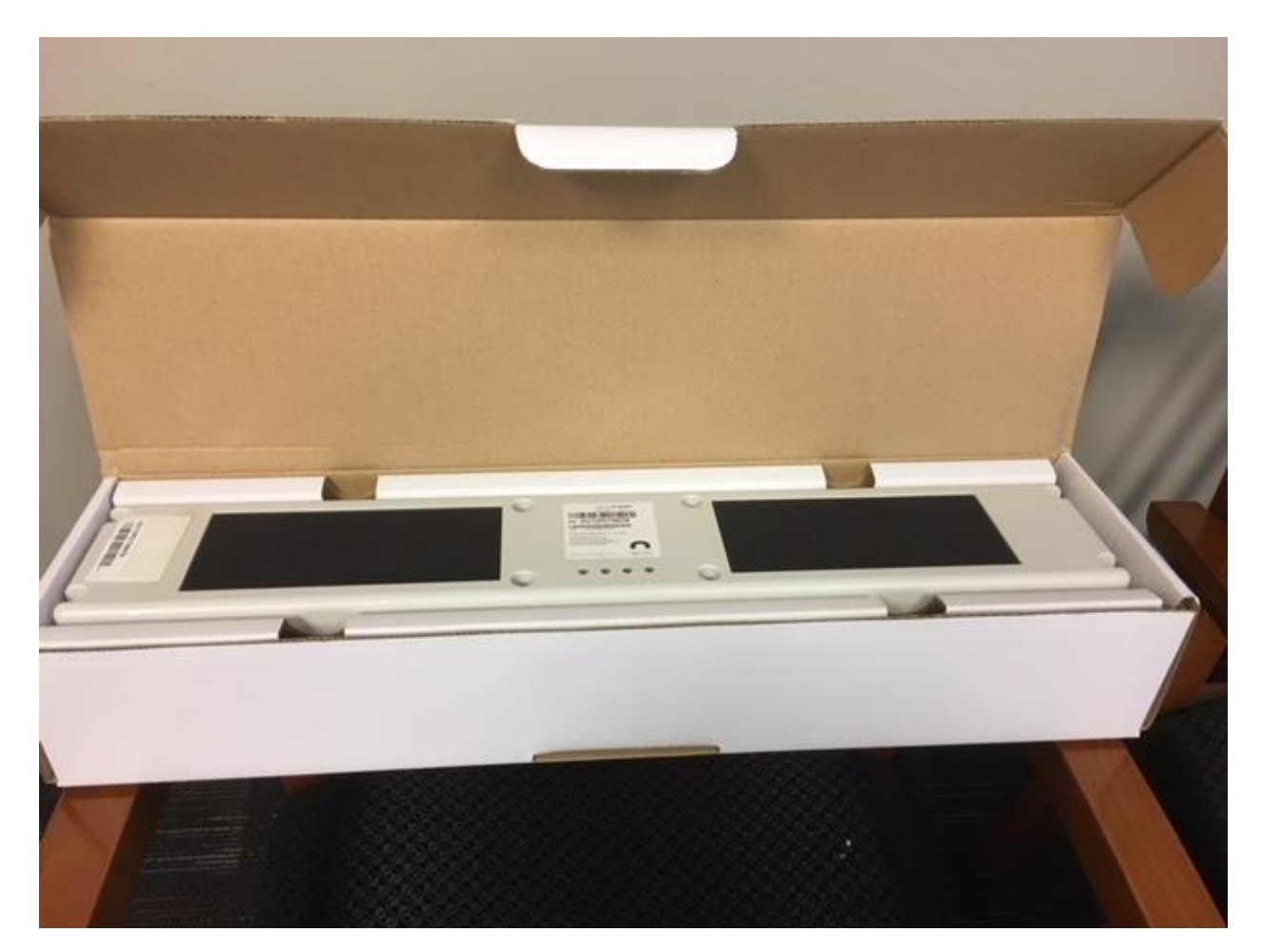
UNIT TOP/EXTERNAL SIDE UP IN BOX