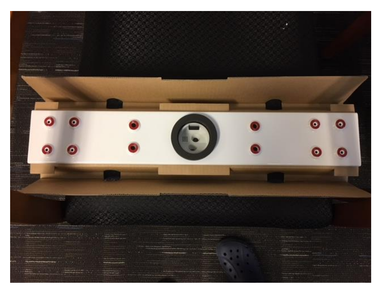
UNIT TURNED UPSIDE DOWN SHOWING INTERNAL/BOTTOM OF ENCLOSURE WITH BRACKET ATTACHED

01044802 FINAL ASSEMBLY (SOMETIMES REFERRED TO AS TOP LEVEL). This level is only the unit all buttoned up. It has the screws and gaskets and the enclosure in its BOM. The enclosure is divided into two main sections: the transducer/mounting inside bottom base 66014702 and the outside/top enclosure piece which has all the boards cables, etc.. 66014802 . The BOM for this level is 01044802_E. The following pictures show the top side all buttoned up, the bottom side, the long sides of the unit, the end side of the unit (both are exactly the same). The last pictures show the unit opened up to show the "transducer or bottom" of the enclosure and the outside/top of the enclosure