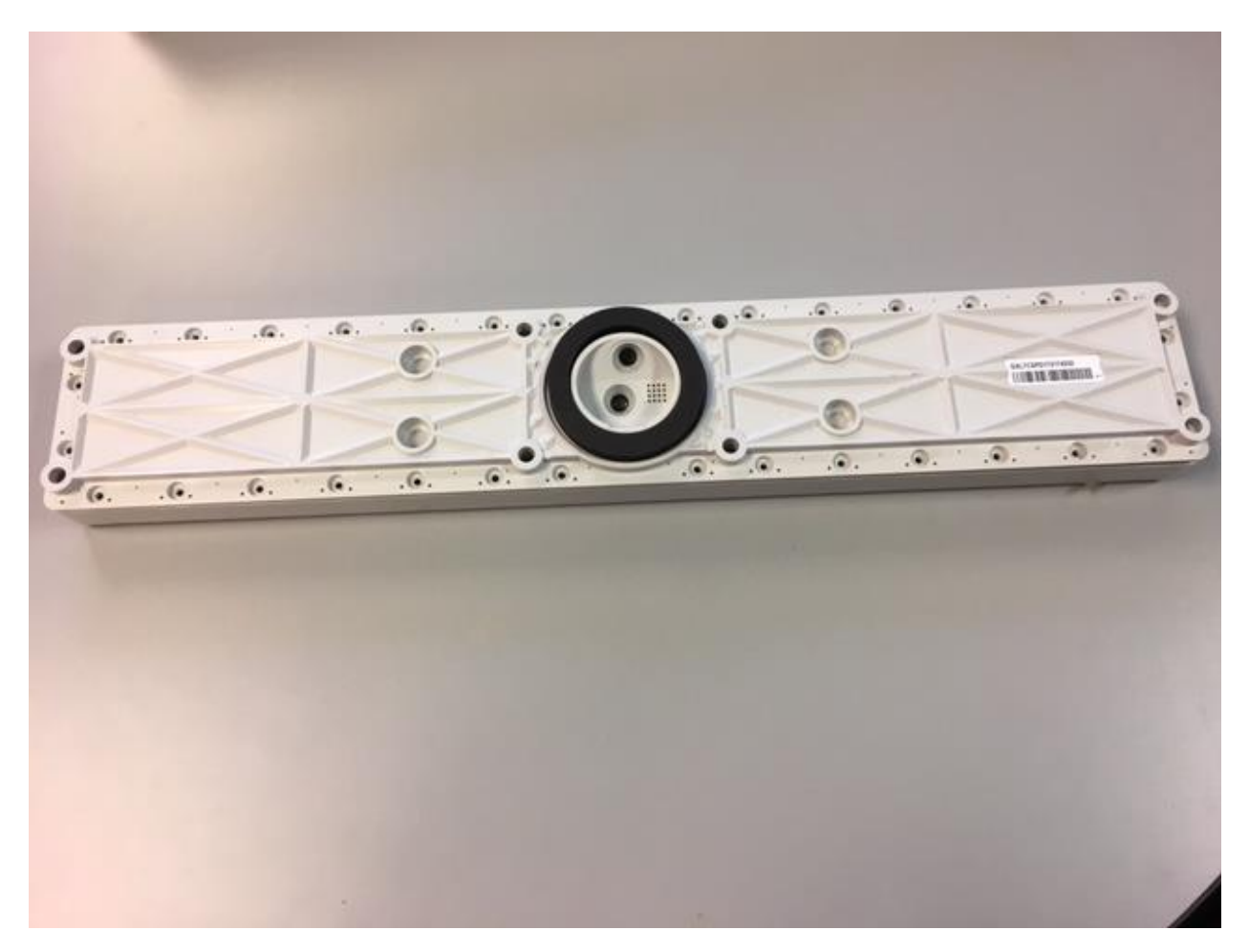
BOTTOM/INTERNAL SIDE OF UNIT WITH CIRCULAR GASKET AND LABELS