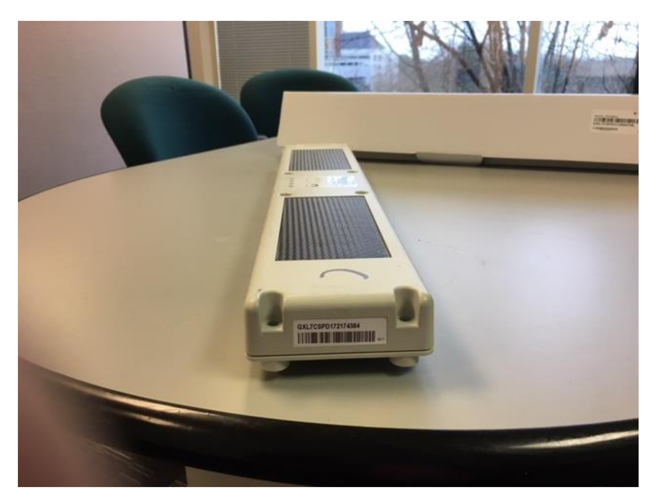
VIEW OF THE END OF THE UNIT X2 (BOTH ENDS HAVE SAME LABEL AND ARE THE SAME)