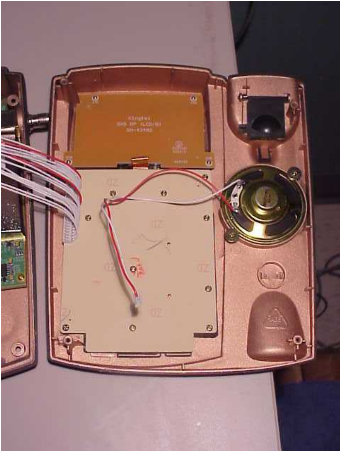
Figure 2: Inside top cover – SX5D