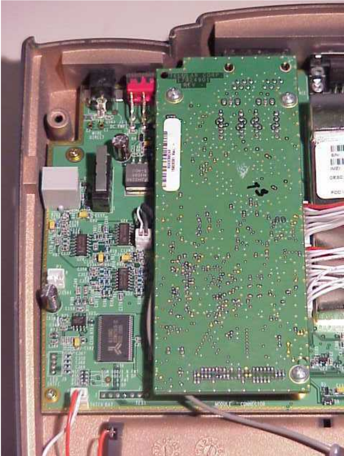
Figure 4: Inside bottom cover with circuit board details – SX5D