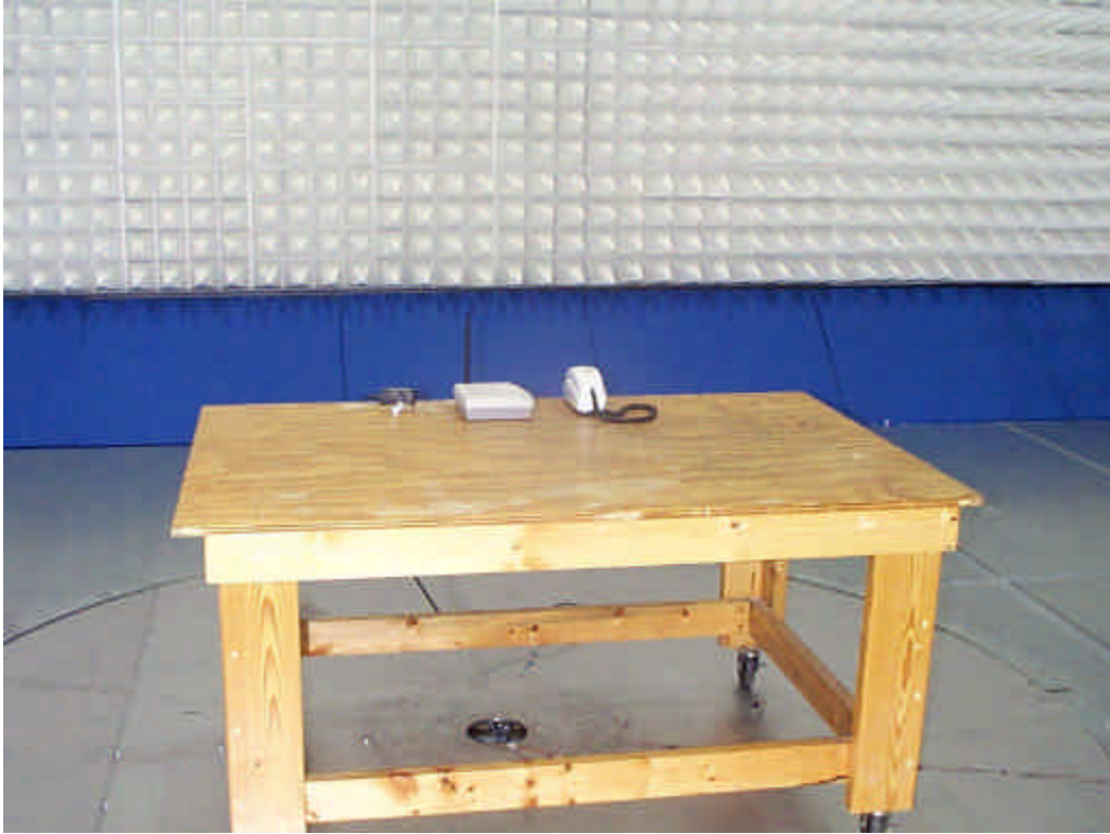
Radiated Emissions – Front