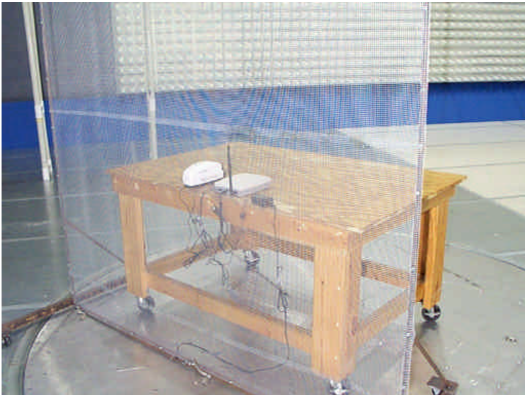
Conducted Voltage Emissions – Back