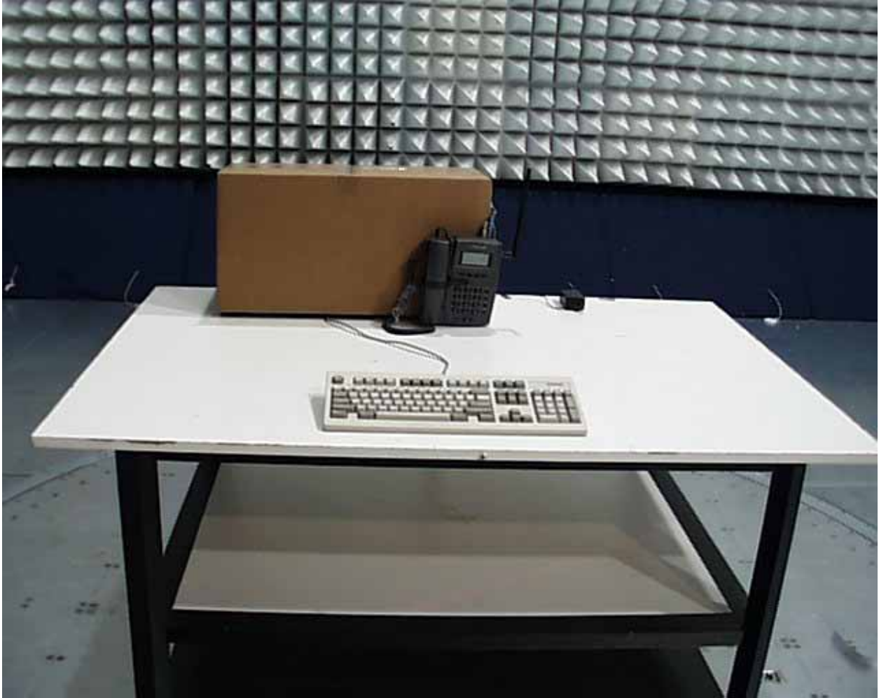
Figure 5: Radiated emissions, wall mount configuration, front view