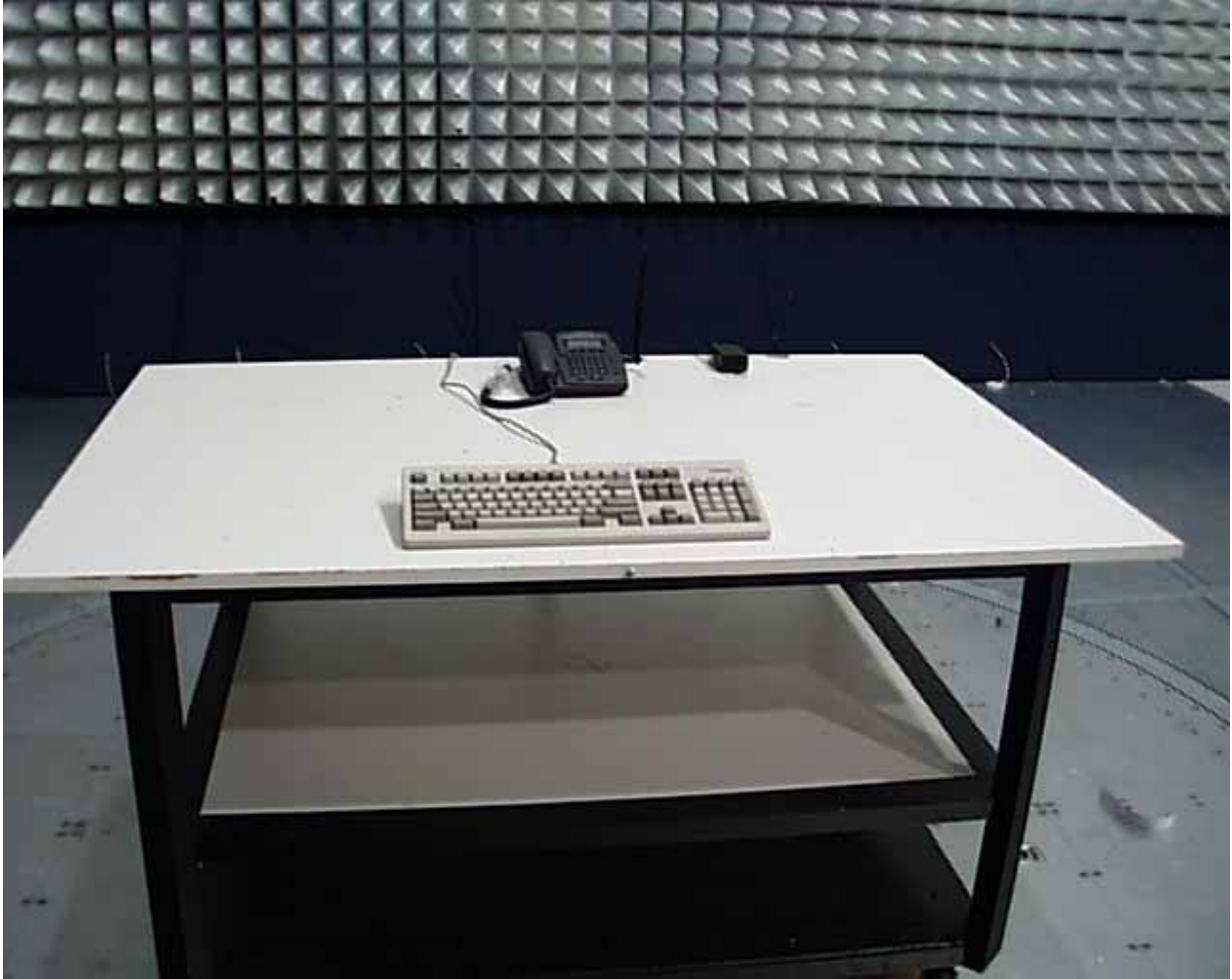
Figure 3: Radiated emissions, tabletop configuration, front view