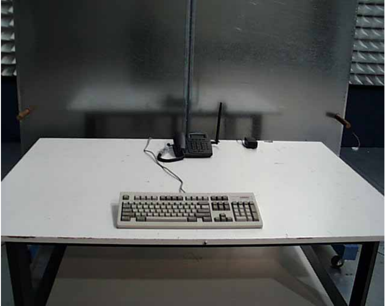
Figure 1: Conducted emission, front view