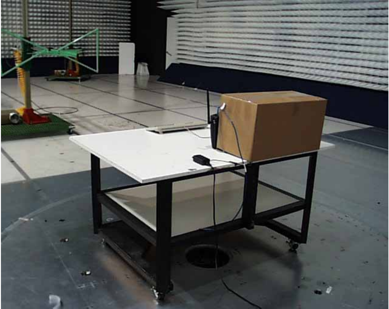
Figure 6: Radiated emissions, wall mount configuration, rear view