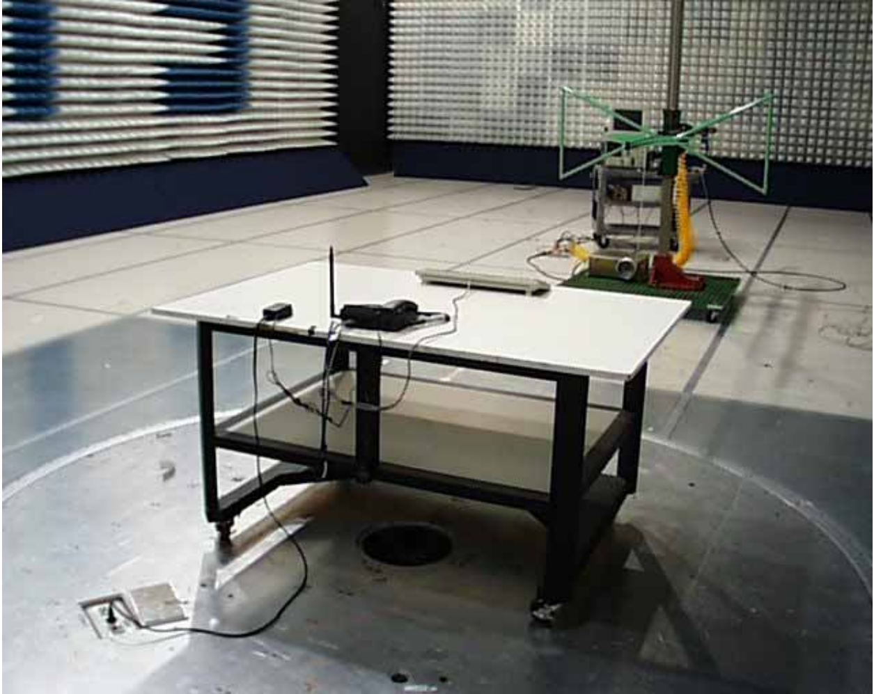
Figure 4: Radiated emissions, tabletop configuration, rear view