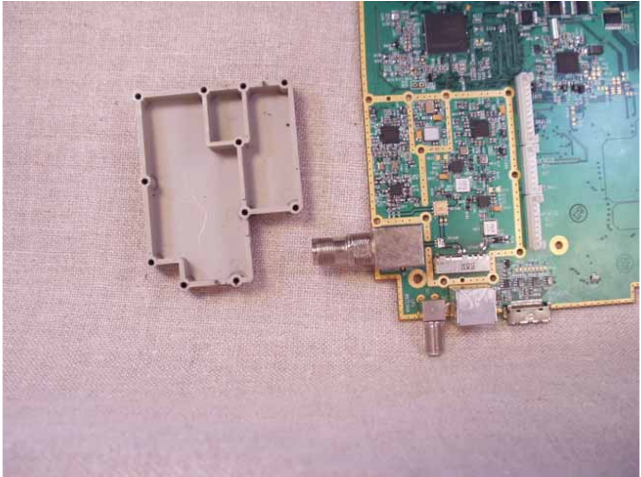
Figure 9: Main circuit board, RF section with cover removed