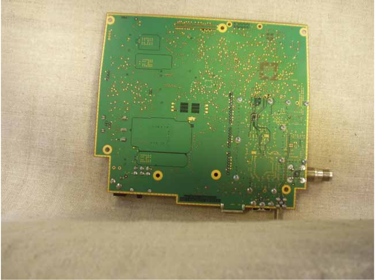
Figure 8: Main circuit board, bottom view