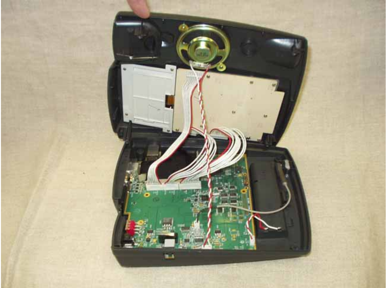
Figure 1: Internal Overview