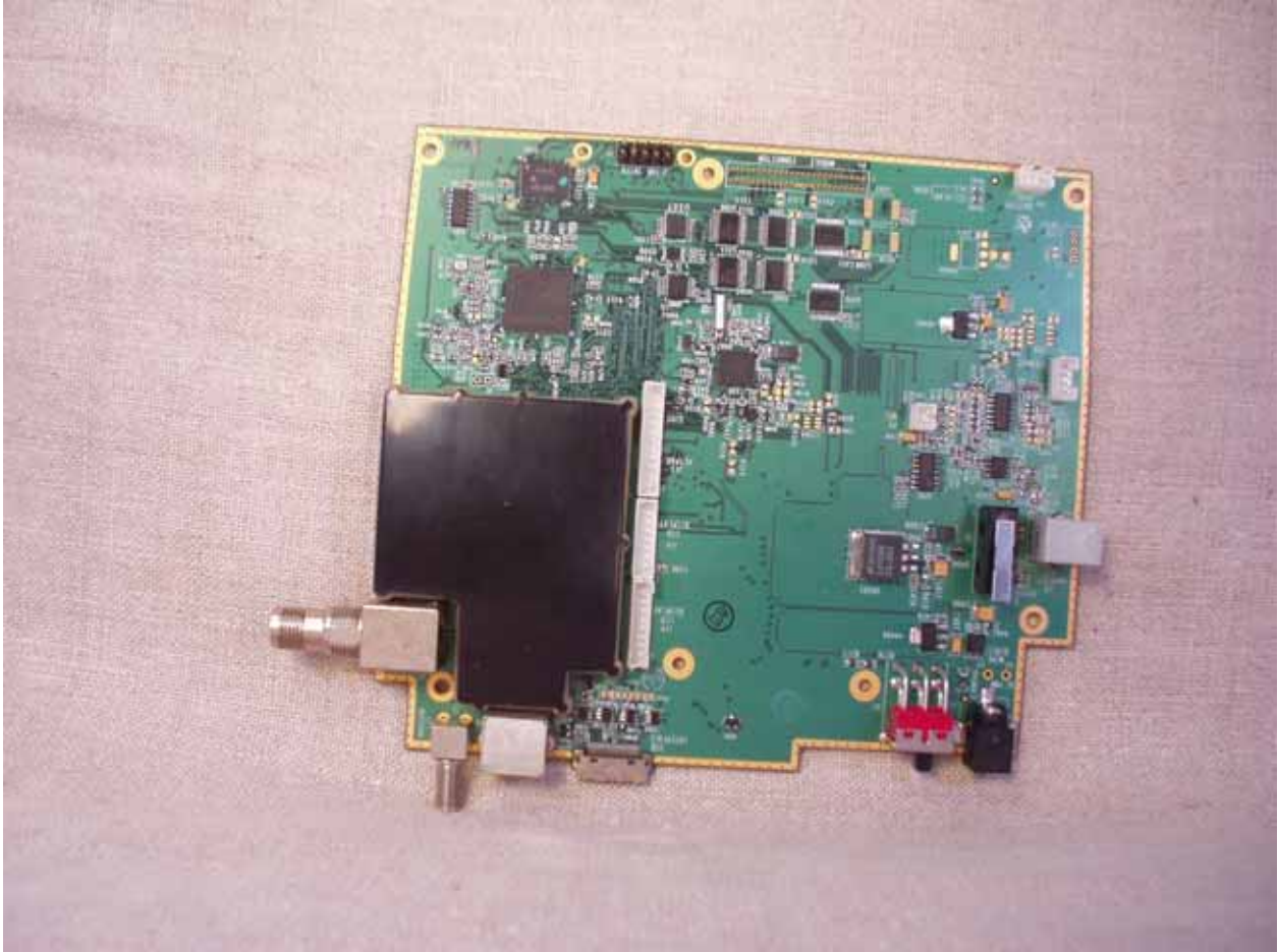
Figure 7: Main circuit board, top view