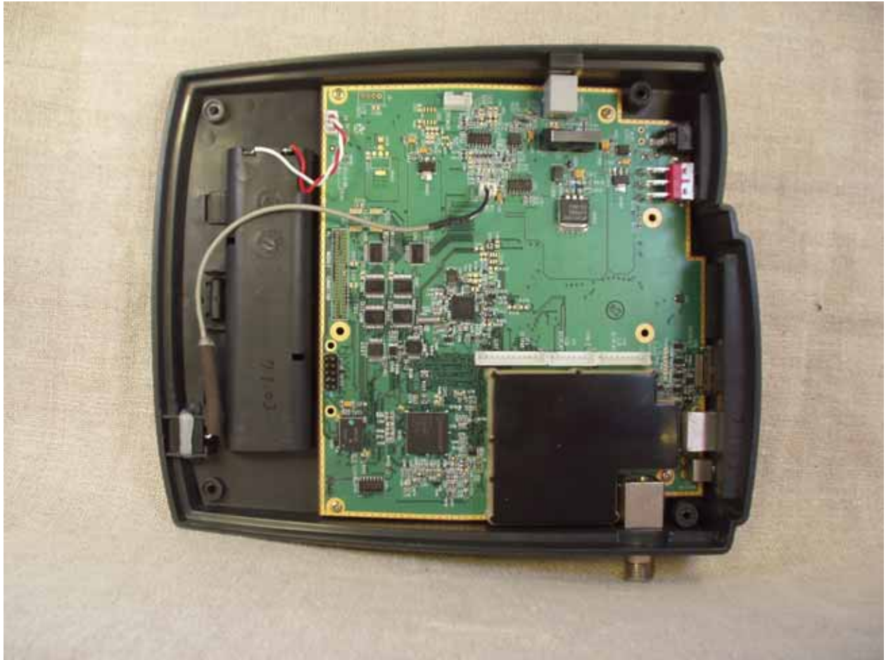
Figure 2: Internal Bottom cover with circuit board