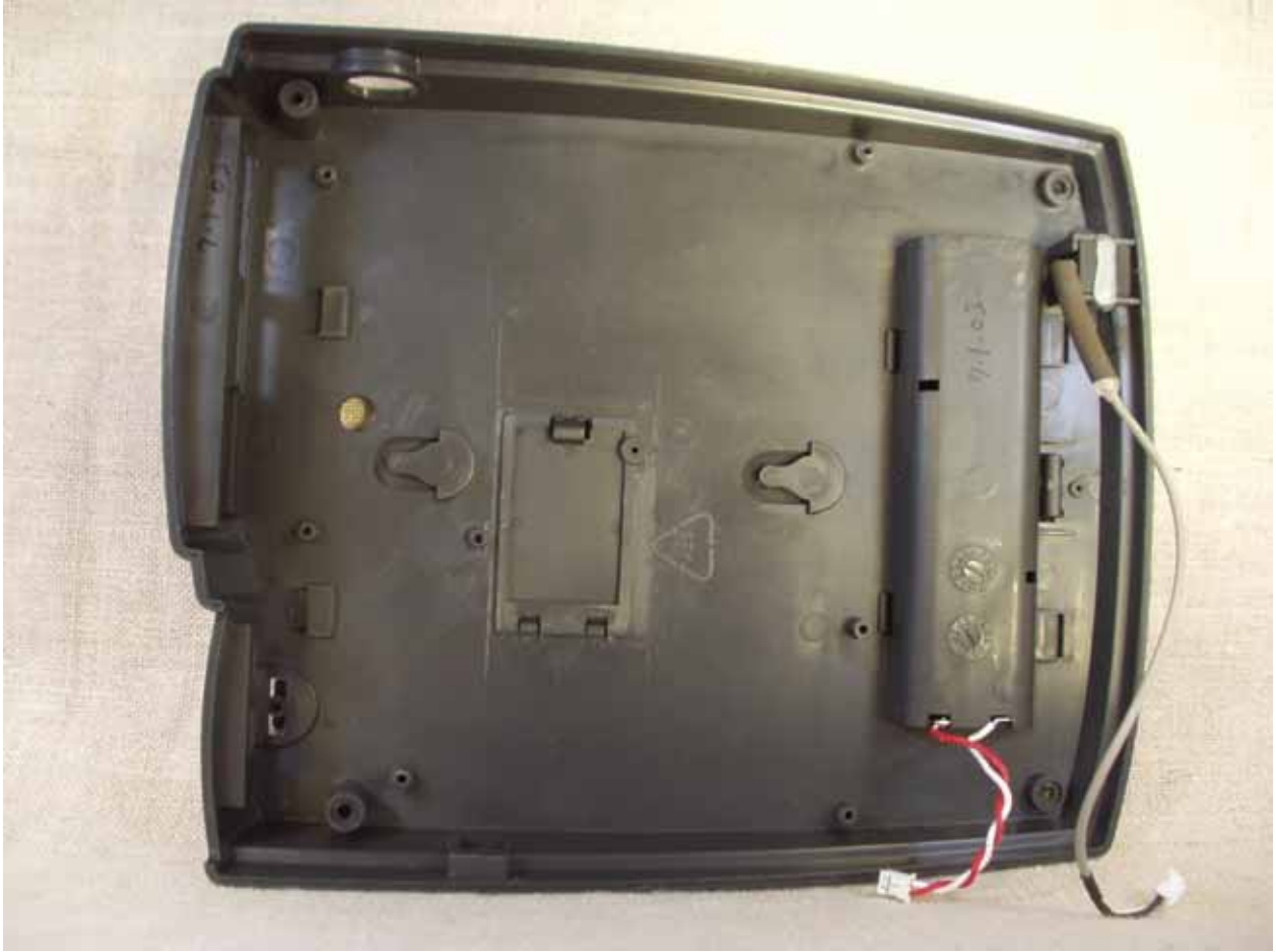
Figure 3: Internal bottom cover