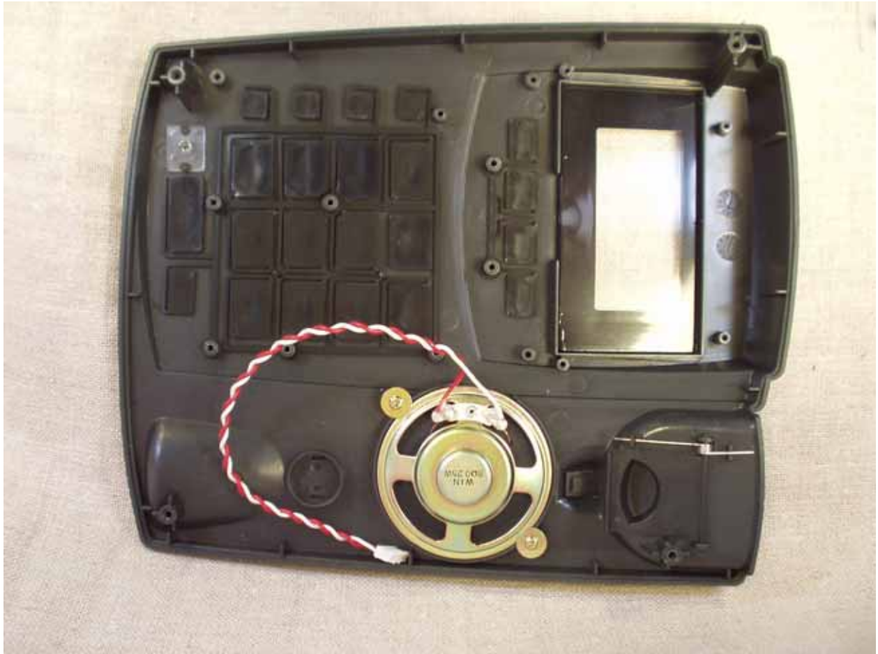
Figure 5: Internal top cover