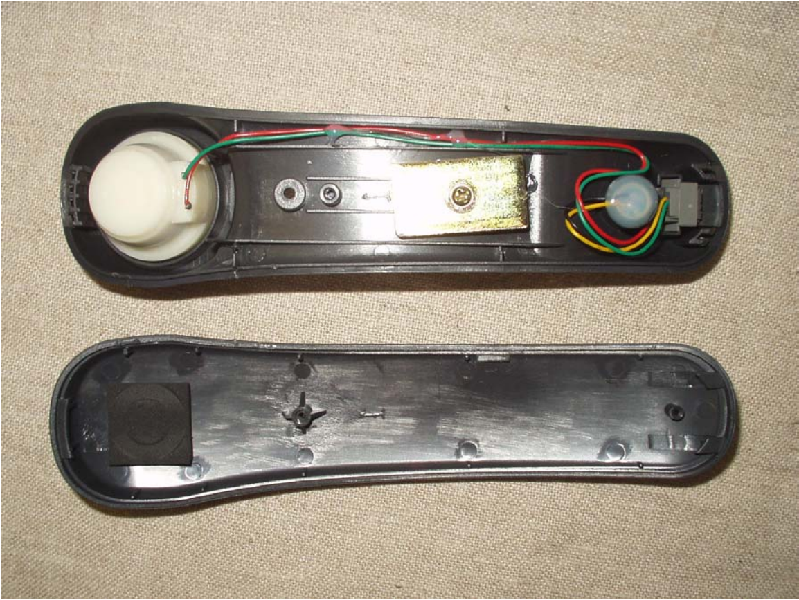
Figure 1-5: Internal photograph, Handset (top and bottom)t