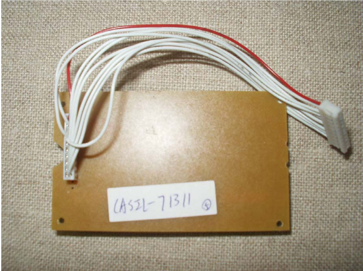
Figure 1-4: Internal photograph, LCD PCB (bottom)