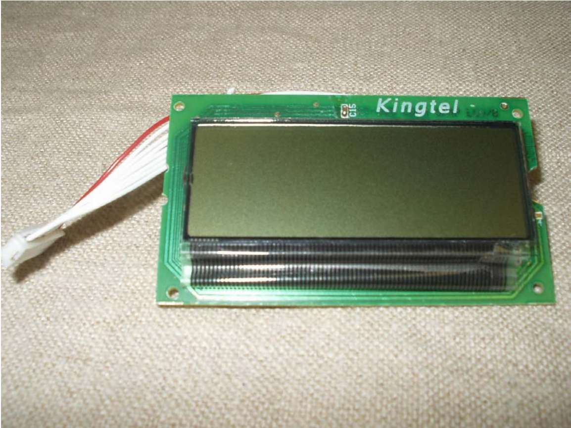
Figure 1-3: Internal photograph, LCD PCB (top)