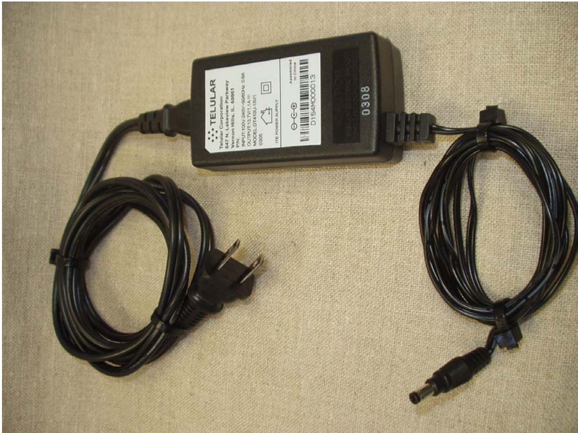
Figure 1-3: External photograph, SX4D AC adapter (top)