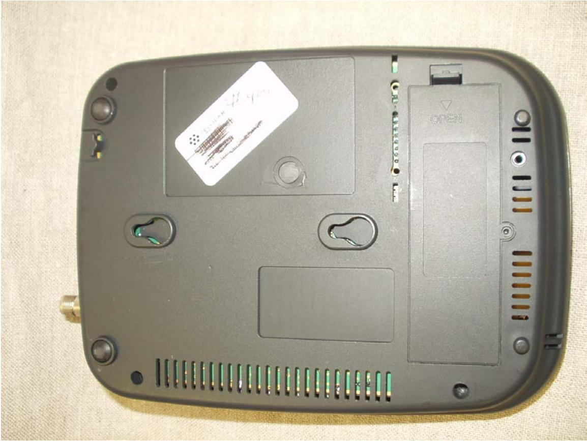
Figure 1-8: External photograph, SX4D Main unit (bottom)