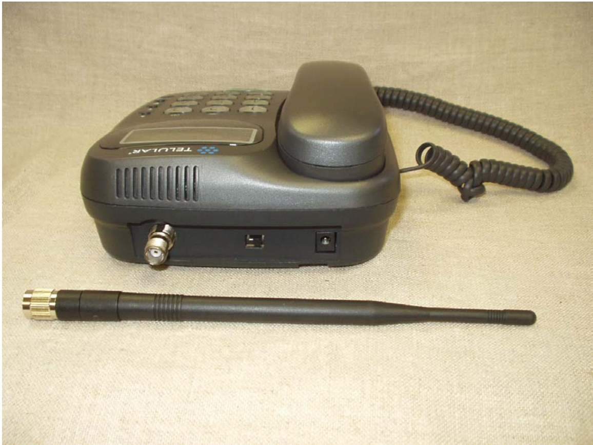
Figure 1-5: External photograph, SX4D Antenna and power ports