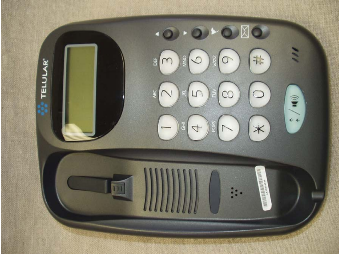
Figure 1-7: External photograph, SX4D Main unit (top)