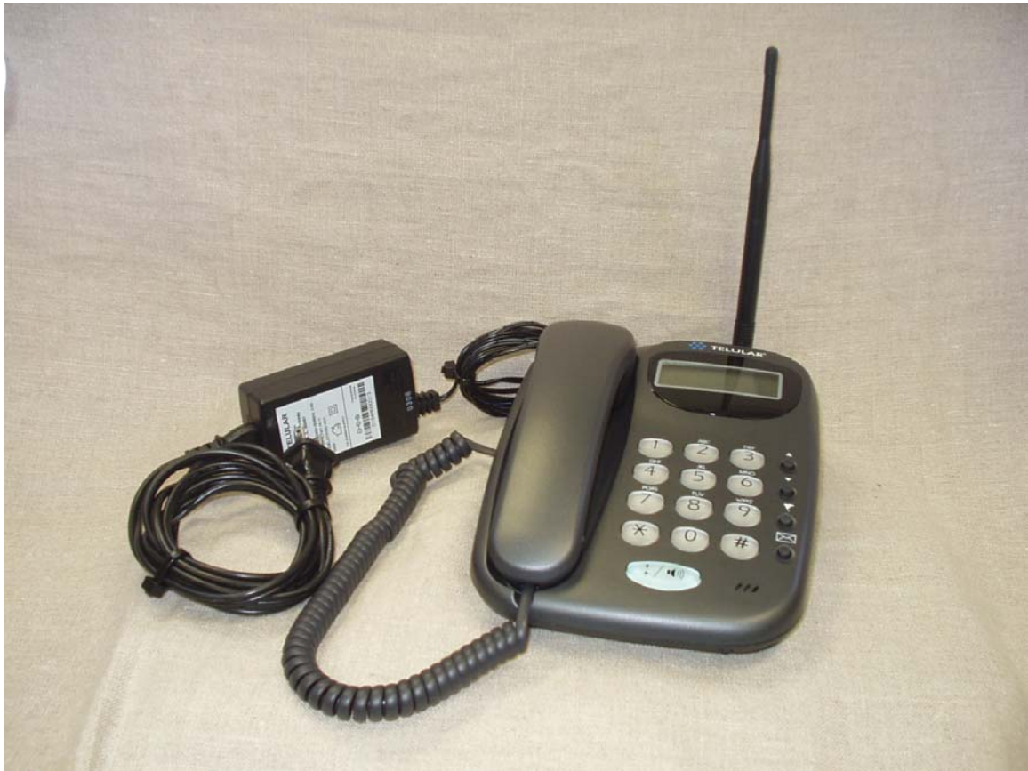
Figure 1-1: External photograph, SX4D with Antenna and AC adapter (front)