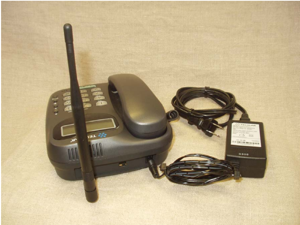
Figure 1-2: External photograph, SX4D with Antenna and AC adapter (back)