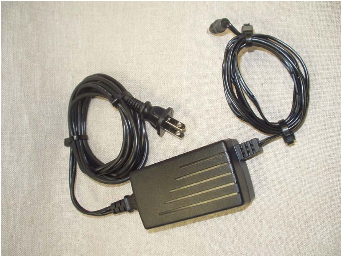
Figure 1-4: External photograph, SX4D AC adapter (bottom)