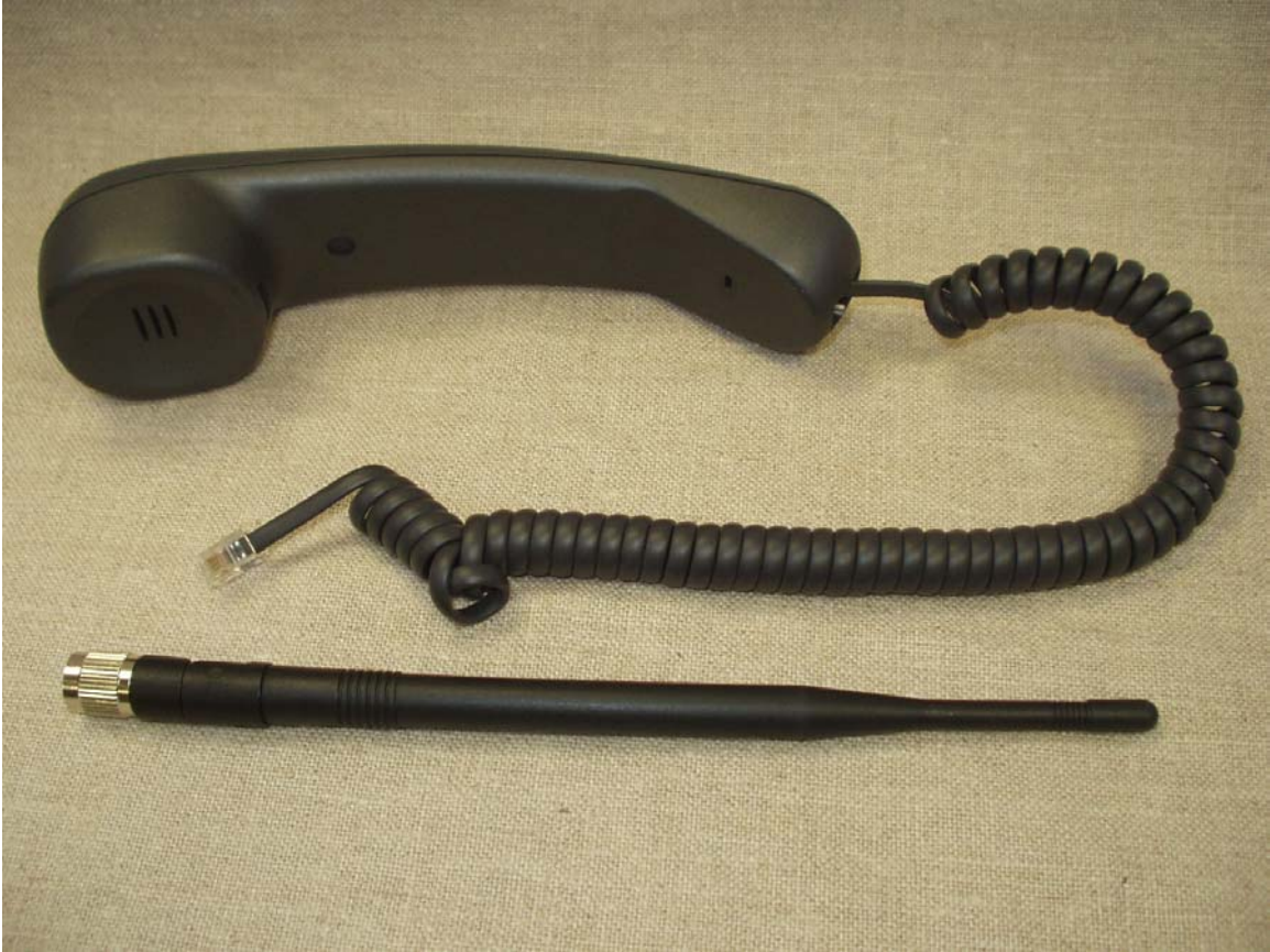
Figure 1-6: External photograph, SX4D Handset and Antenna