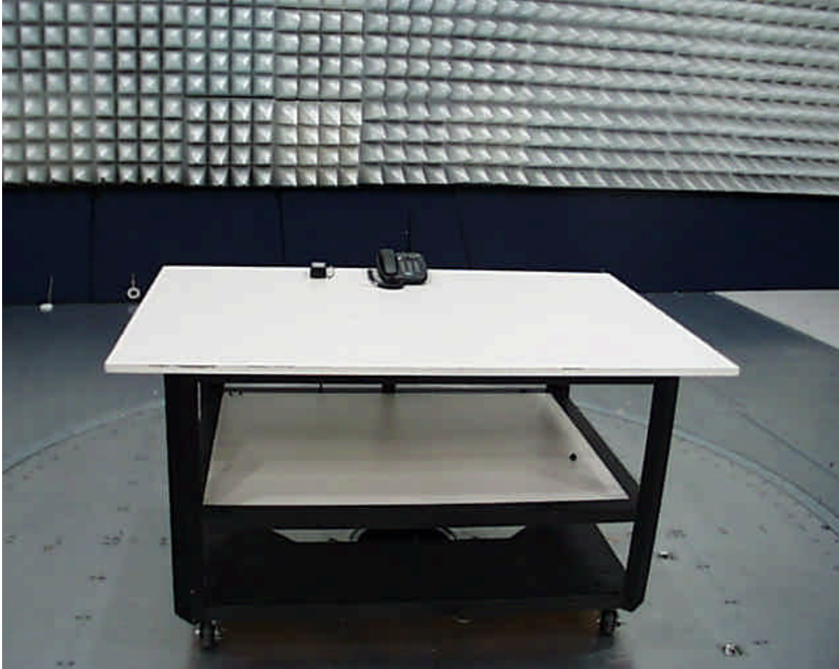
Figure 13-1: Configuration photograph, radiated emission, front view

Figure 13-1 and Figure 13-2 show the testing configurations used.