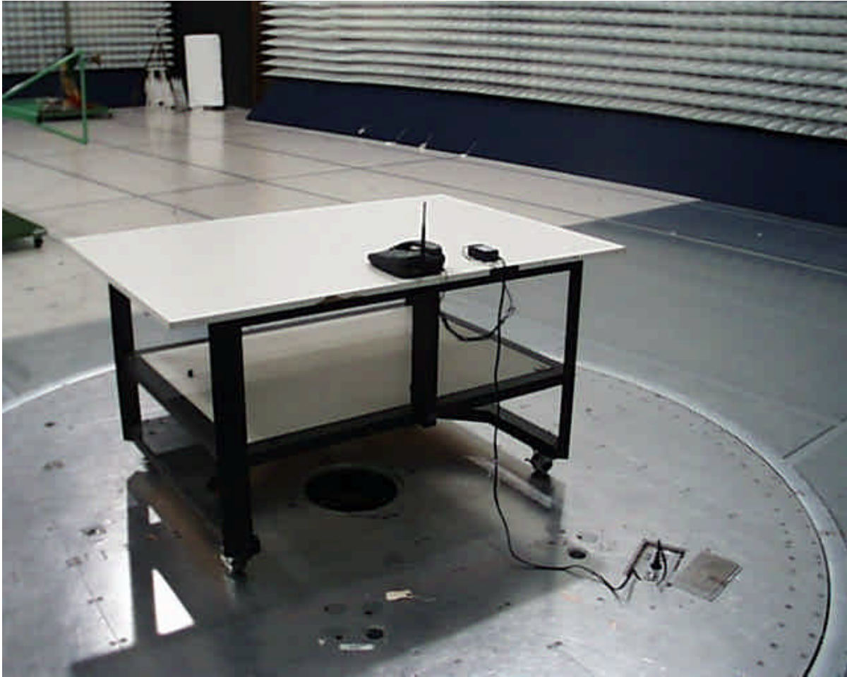
Figure 13-2: Configuration photograph, radiated emission, rear view