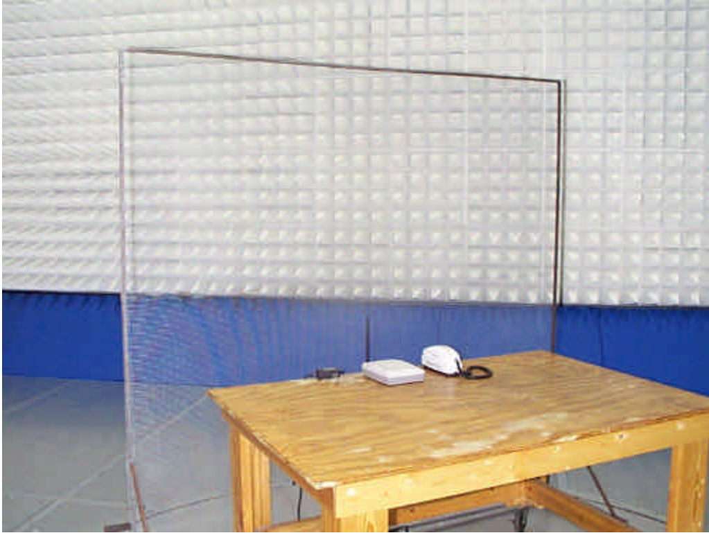
Conducted Voltage Emissions – Front