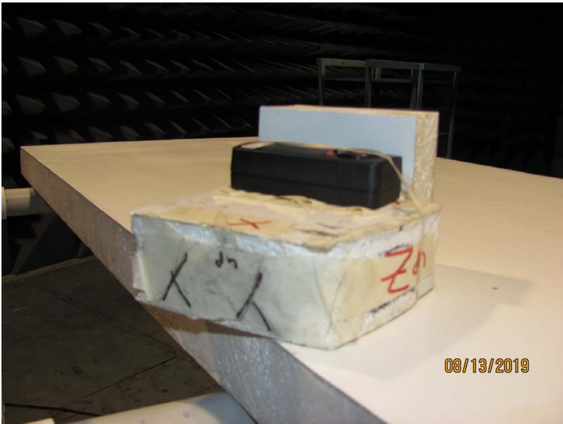
The EUT was taped to a foam stand to change the axis of rotation.