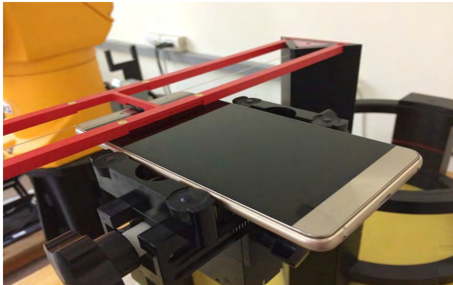
Fig. 2 Receiver of mobile contact center of Arch