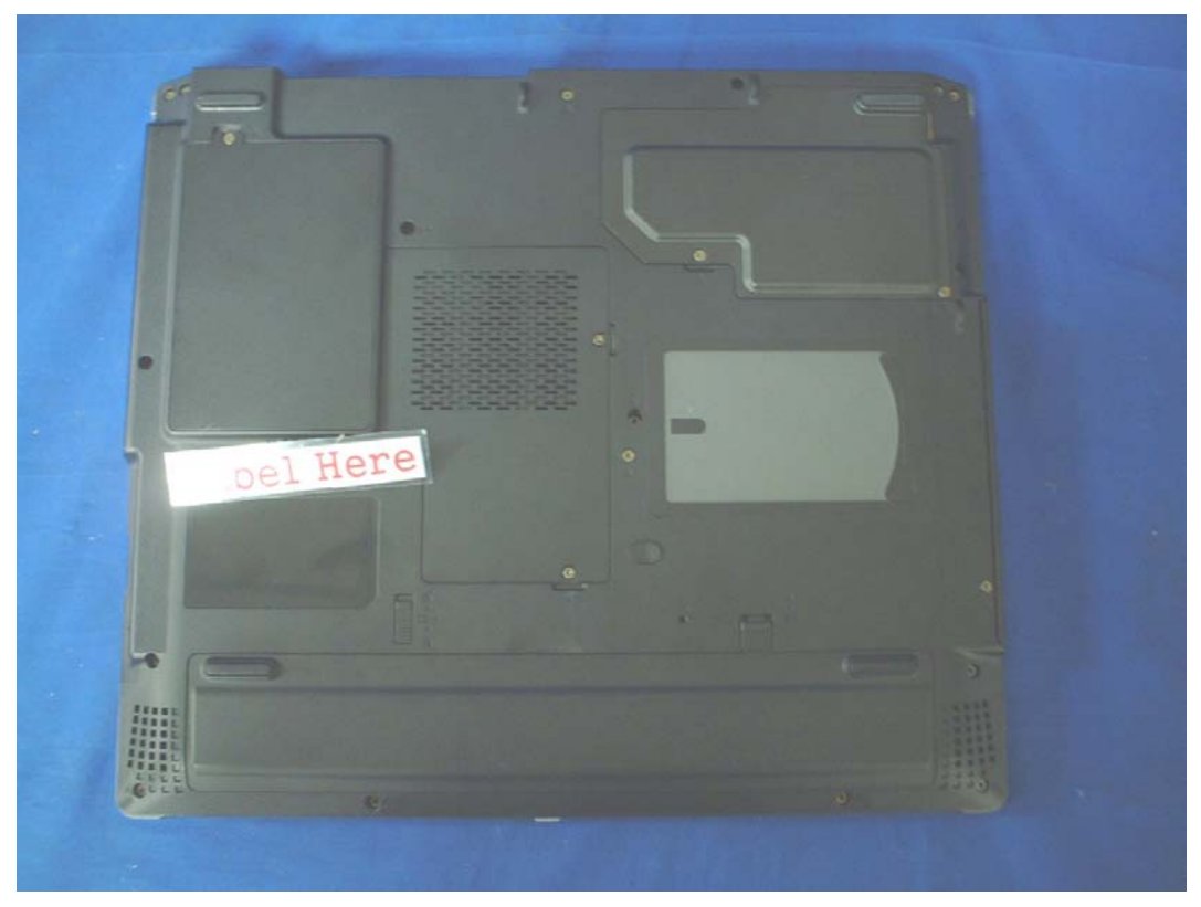
The FCC ID and DoC Label will be placed on the equipment as shown in the photograph below.