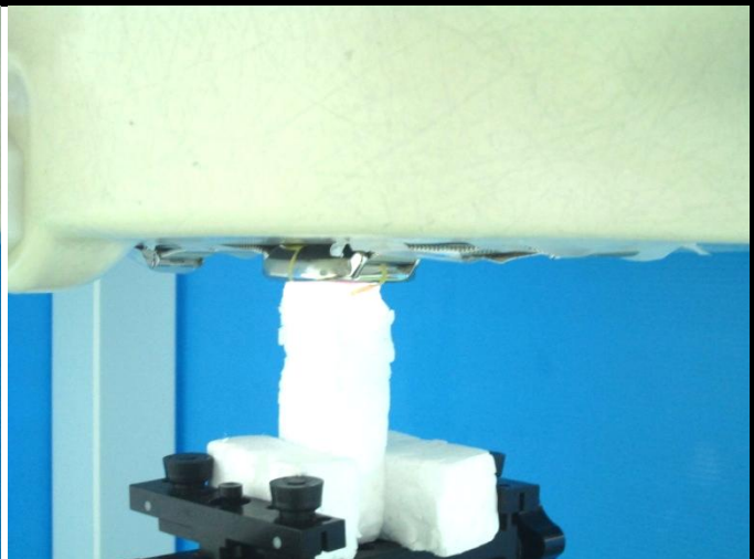
Rear Face of EUT with 0 cm Gap <EUT 2>