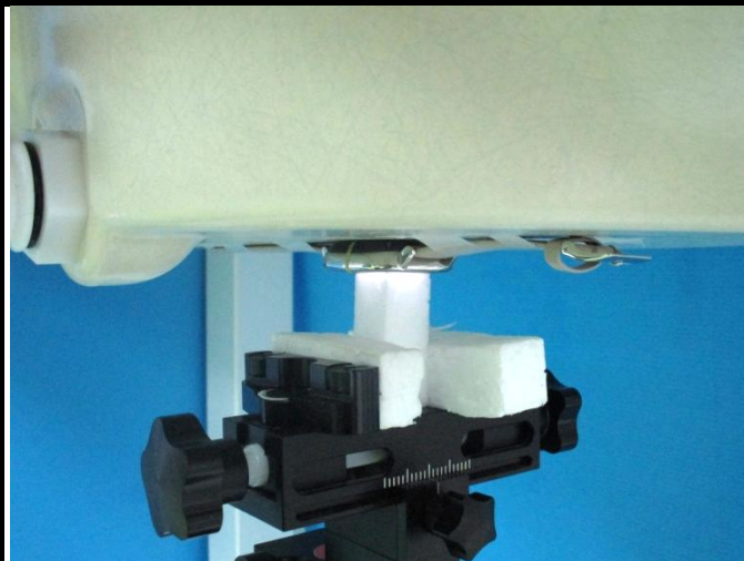
Rear Face of EUT with 0 cm Gap <EUT 1>