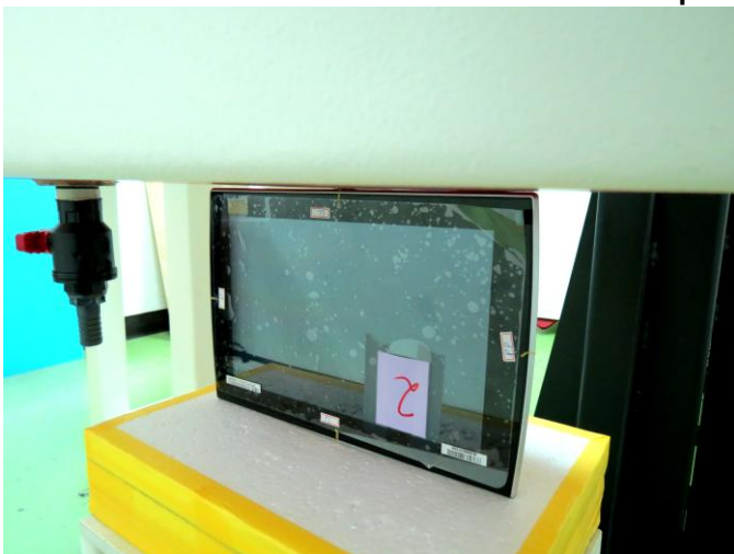
Tablet Mode – Secondary Landscape with 0 cm Gap