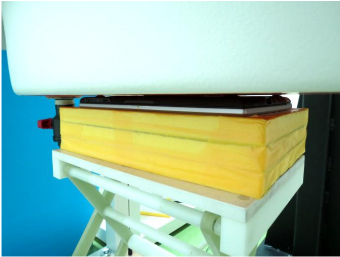
Tablet Mode – Rear Face of EUT with 0 cm Gap