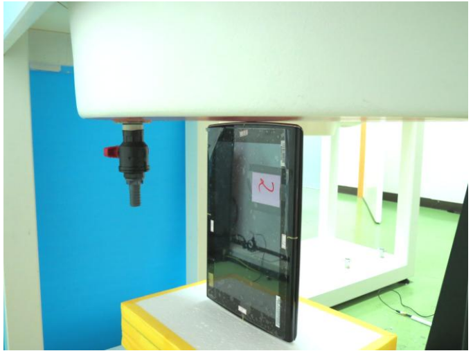
Tablet Mode – Primary Portrait with 0 cm Gap