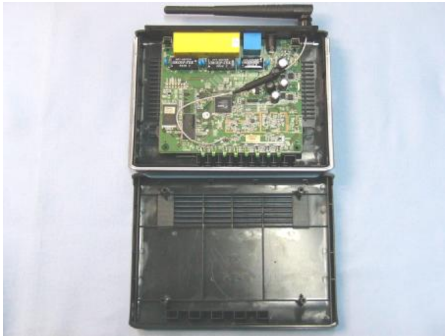
Main & RF board component side