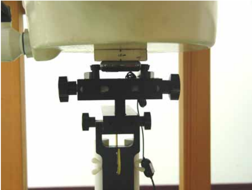
Front Face with 1.5cm Gap