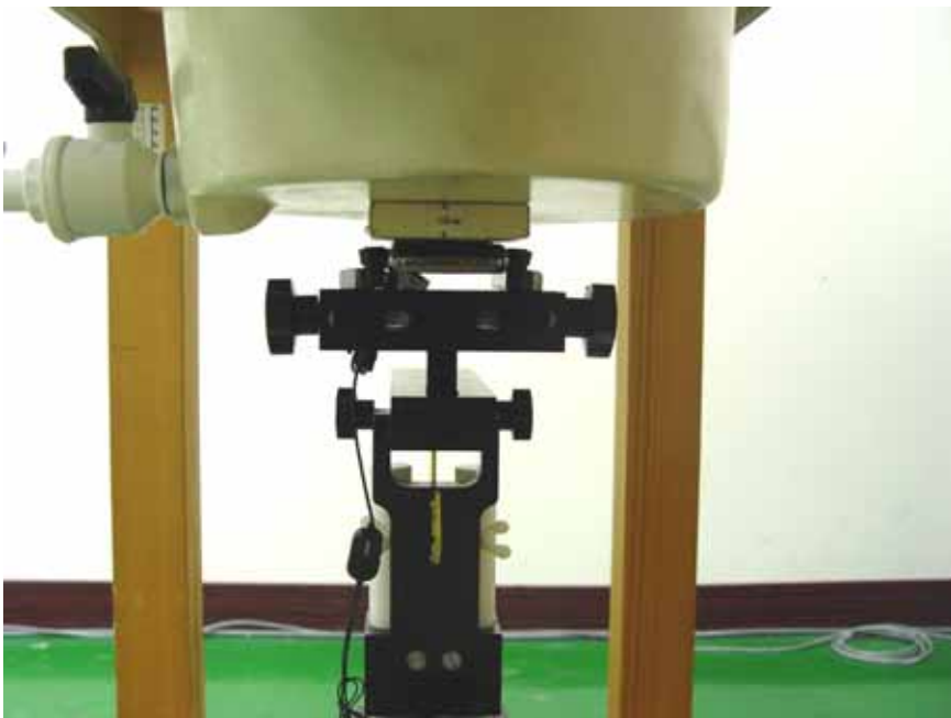
Rear Face with 1.5cm Gap