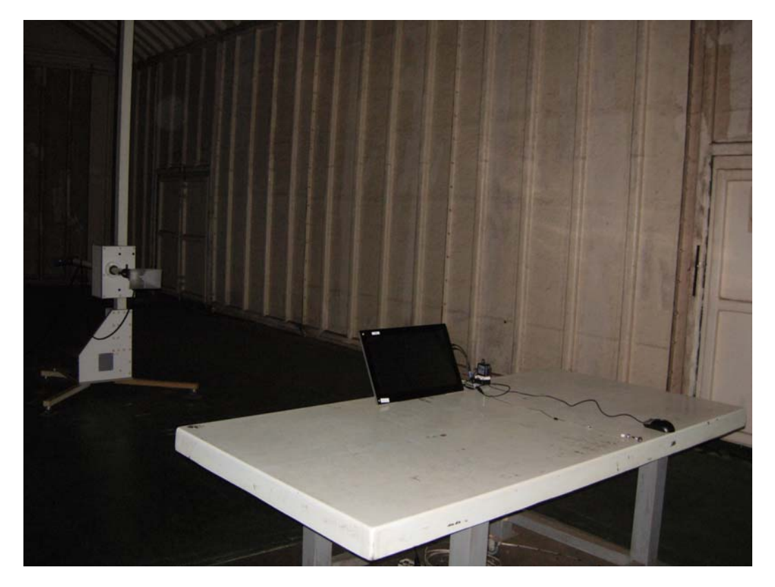
Back View of Radiated Test (Horn)