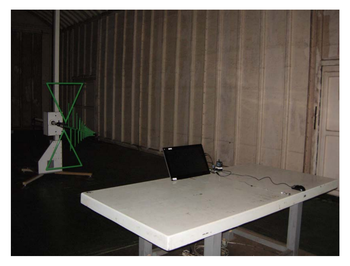
Back View of Radiated Test