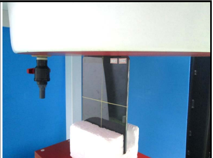
Top Side of EUT with 0 cm Gap