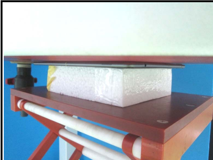
Rear Face of EUT with 0 cm Gap