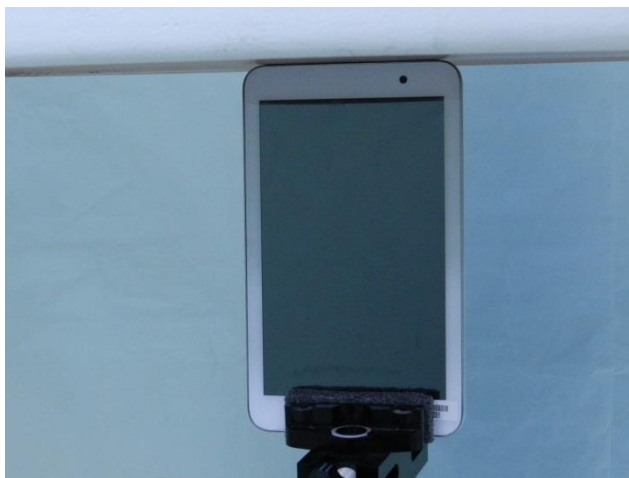
Edge1, Test Separation 0 cm