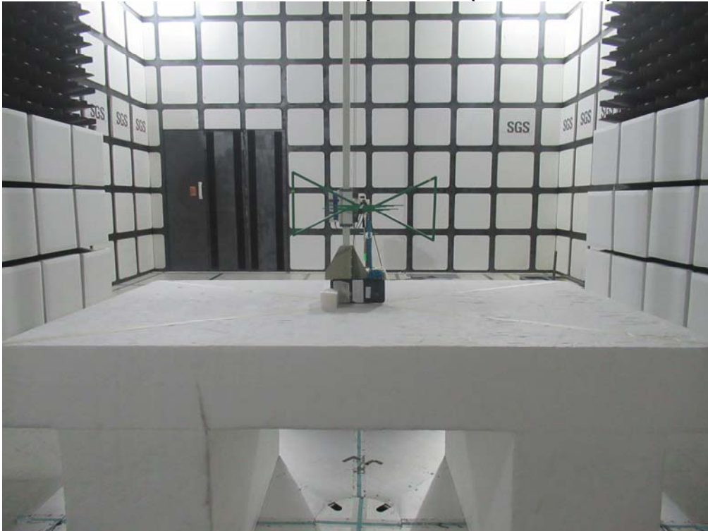
Radiated Emission Set up Photos (Above 1GHz)