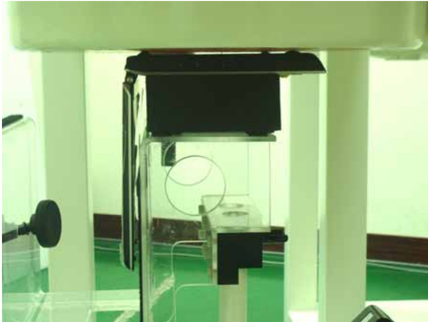
Bottom of the DUT with 0 cm Gap