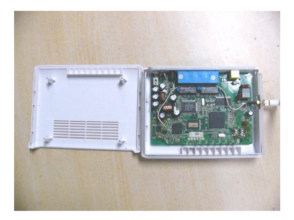
Main & RF inside whole view