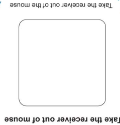
Take the receiver out of mouse

Switching Channels Please do not use volatile organic solvent to clean this product. It is likely to cause painting spray damaged. Please clean it with soft cloth. Please do not use the product with medical equipments, atomic facilities, accidents or social damages, or life-related facilities. If any mouse causes the accidents or social damages, the manufacturer will not take any responsibility.